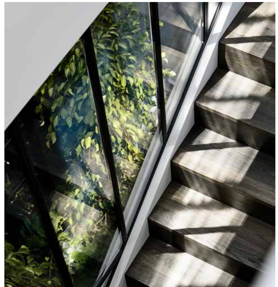
Grande flush mitred-nosing stairs in colour Otta – Casa Atrio, Carlton