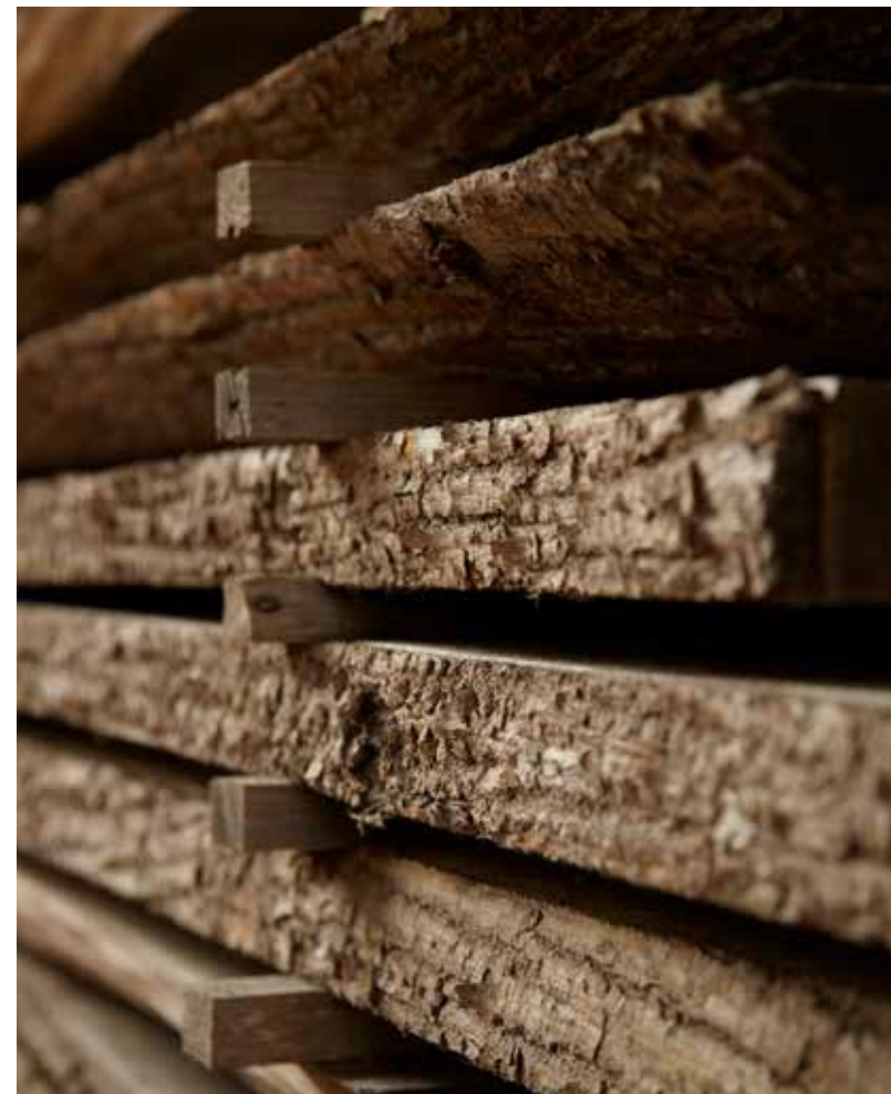
We have set new standards in sustainable manufacturing