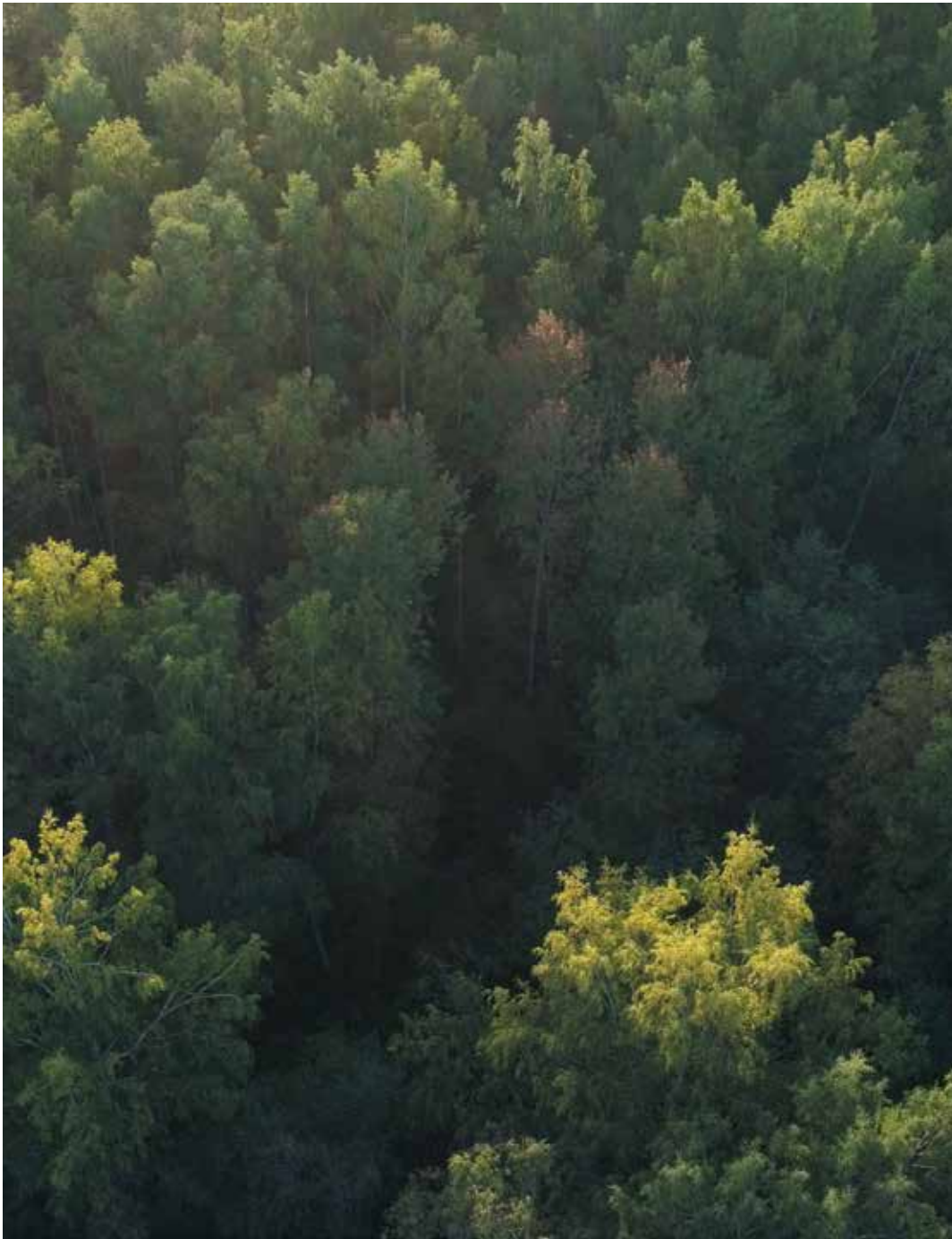
Our oak is carefully sourced from responsible plantations across Europe

Timber is one of the oldest and most beautiful materials on earth. At Tongue & Groove, we have captured its essence and brought it into the future with our unique three-layered construction that results in boards that defy expectations. Crafted to the highest standards in an extensive range of colours, finishes, and sizes, our layered European oak boards transform the potential of engineered timber, opening up possibilities beyond flooring.