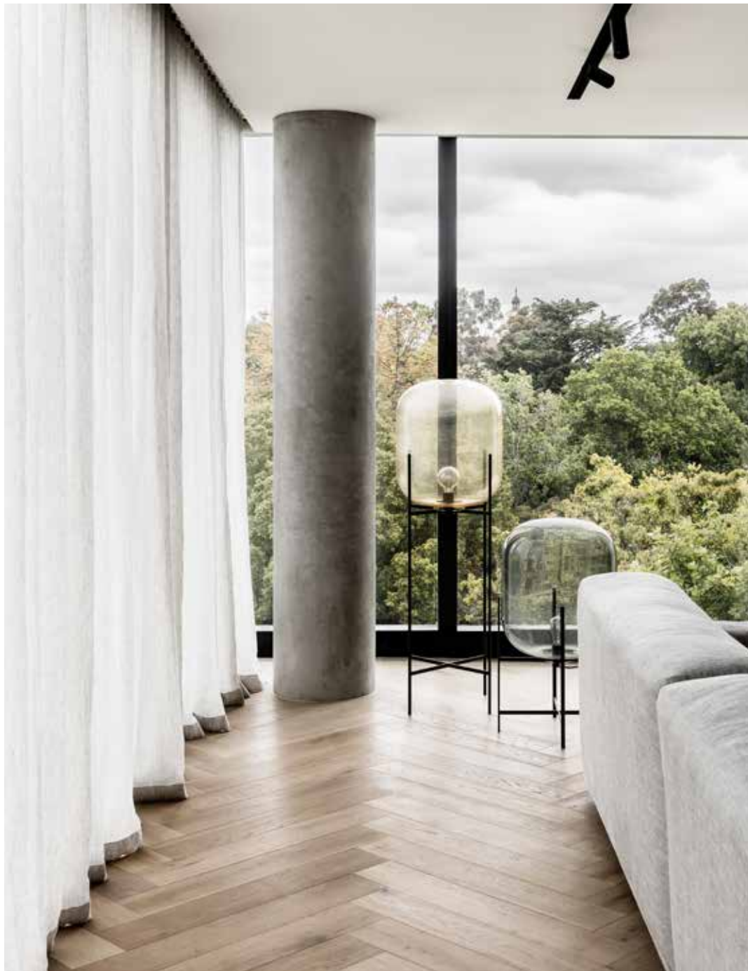
Herringbone flooring in colour Oslo – The Alexandra Penthouse, Sydney