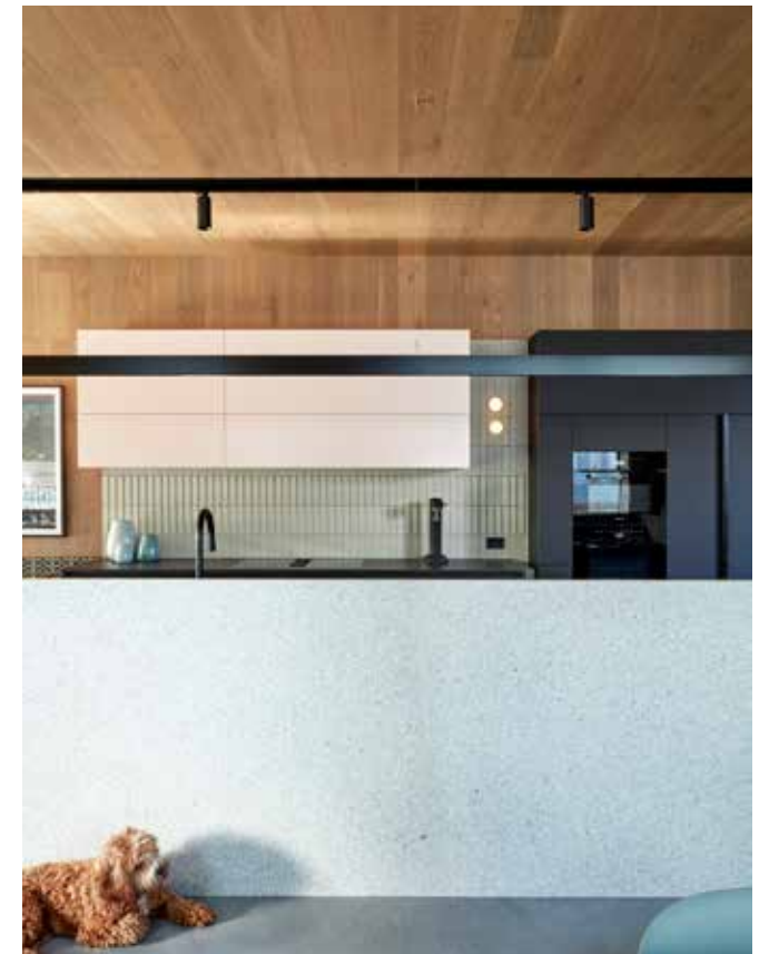
Piccolo boards in colour Oslo – Uxbridge House, Brisbane

We have showrooms in Sydney, Melbourne, Brisbane and Adelaide, and teams in New Zealand and New York, enabling us to support projects across Australia and beyond. Most importantly, our original commitment to honouring the nobility, beauty, and strength of European oak is still at the heart of everything we do.