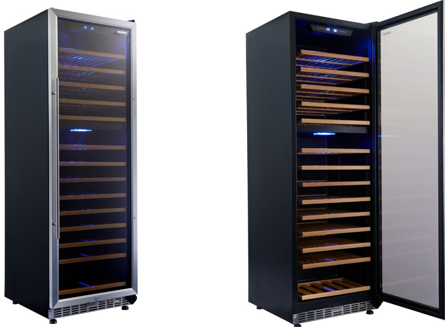
Stainless Steel Trim Shown