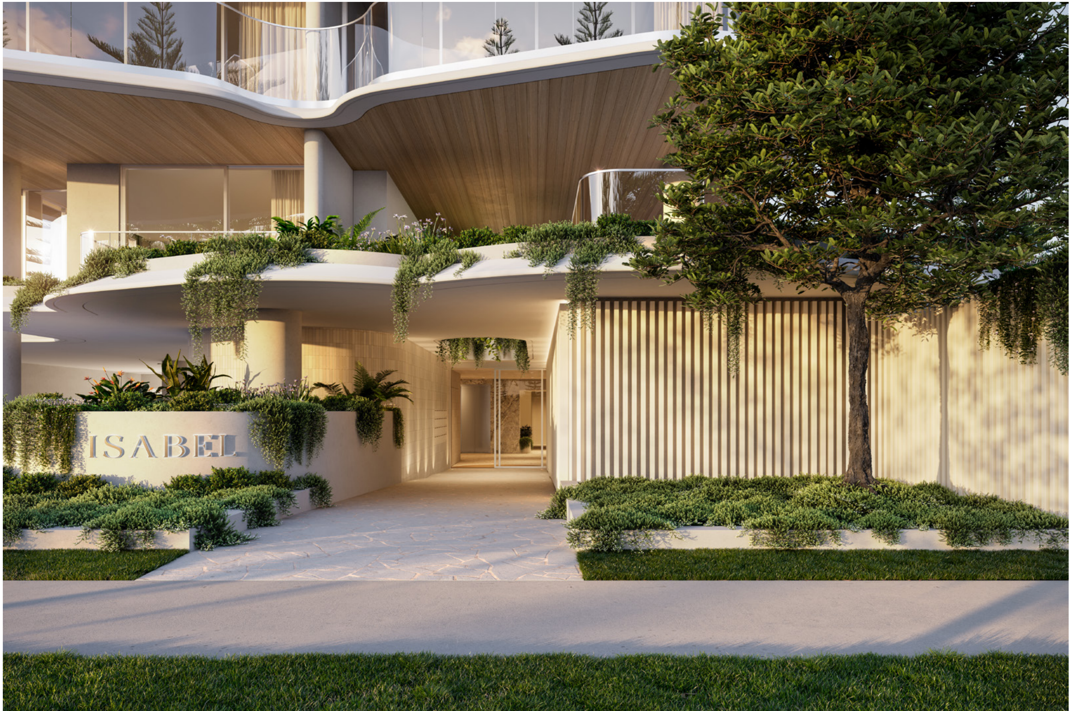
Artist impression only. The final product may differ. Landscaping indicative only. Refer to back page.