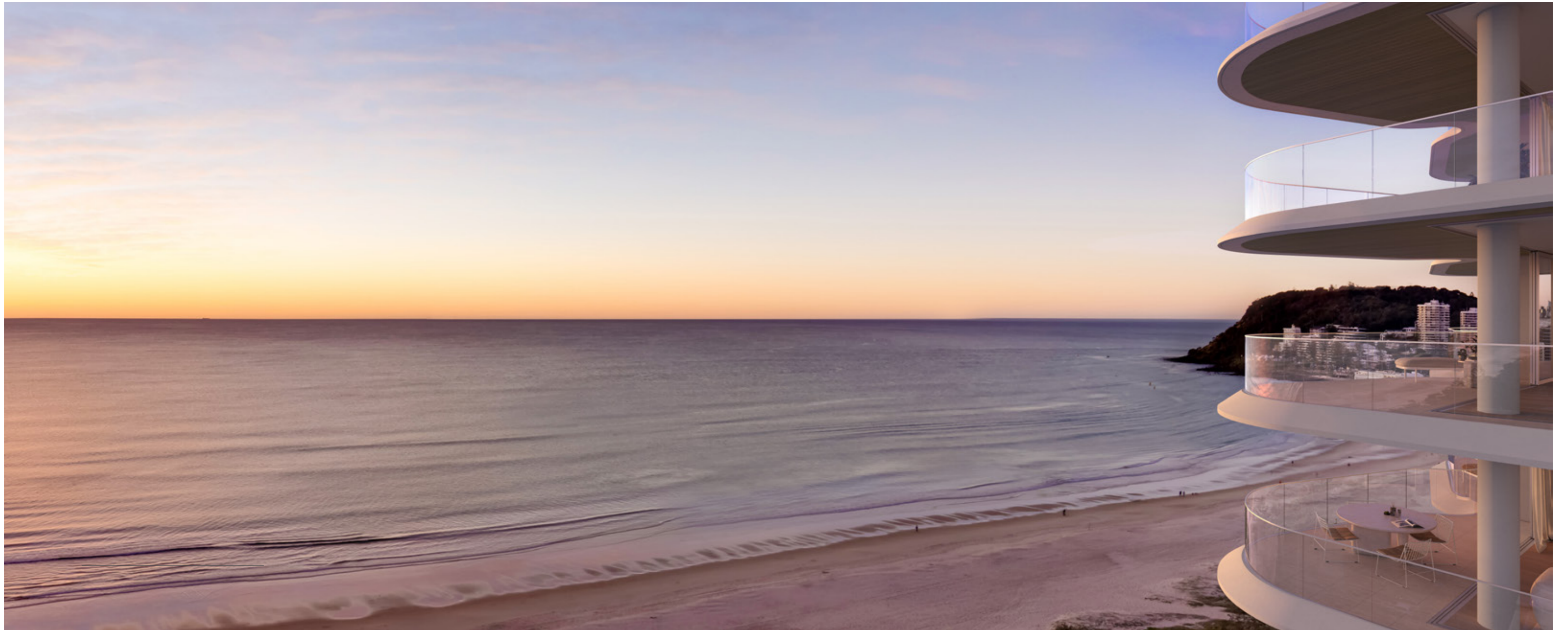
Artist impression only. The final product may differ. Refer to back page. Image features B&B Italia Tobi-Ishi Outdoor Table by Edward Barber & Jay Osgerby, available from Space.