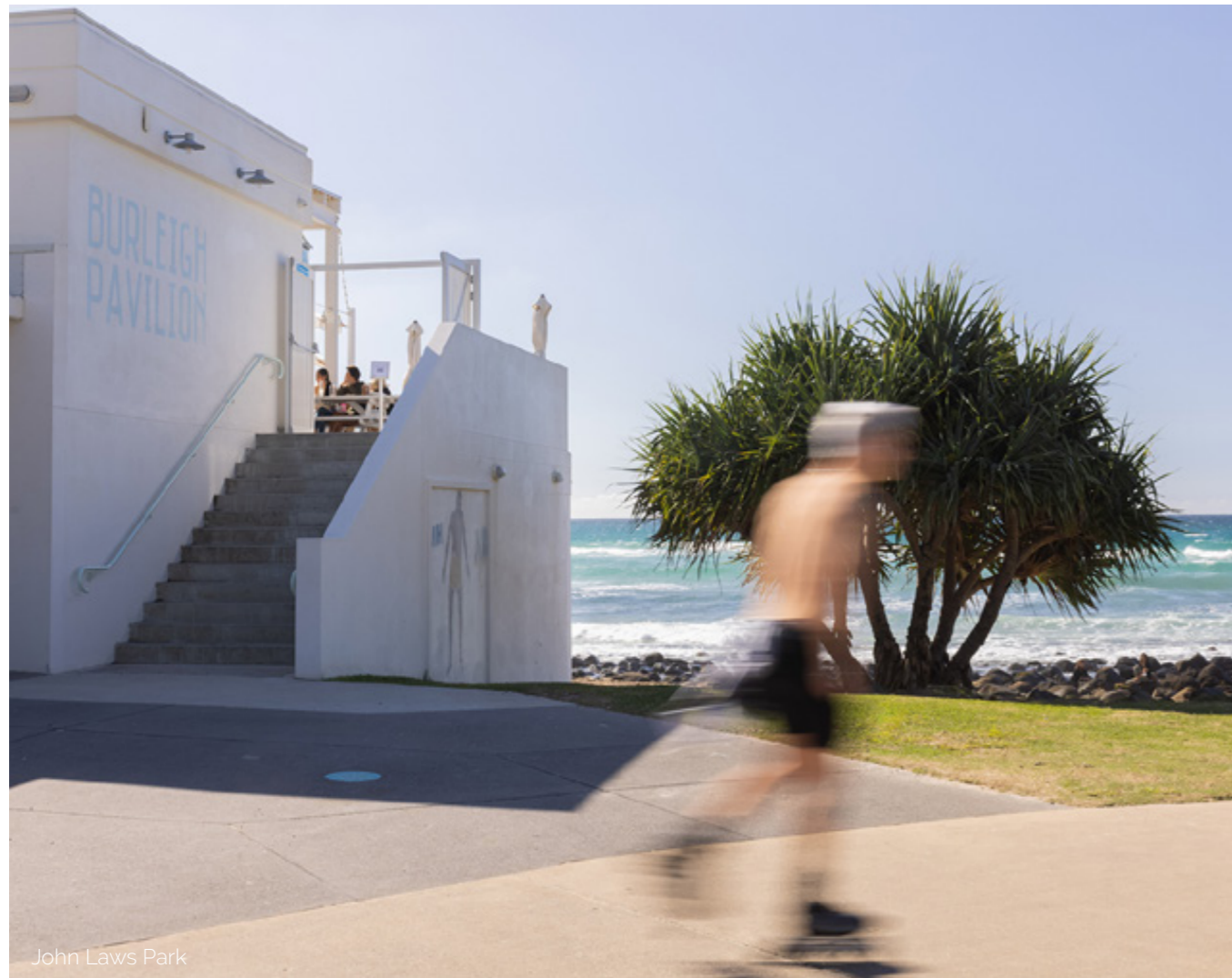
John Laws Park