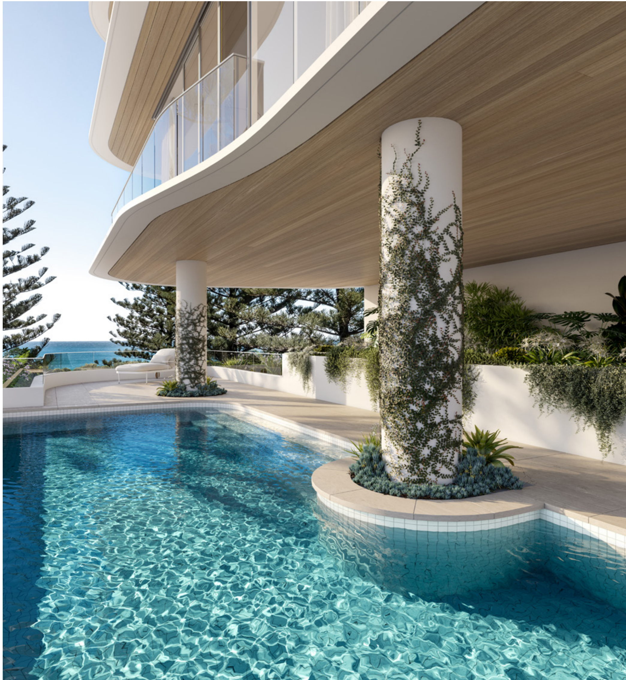
Artist impression only. The final product may differ. Landscaping indicative only. Refer to back page.

Combining art and functionality, Residents and guests can unwind and socialise in curated spaces adorned in the finest furniture.