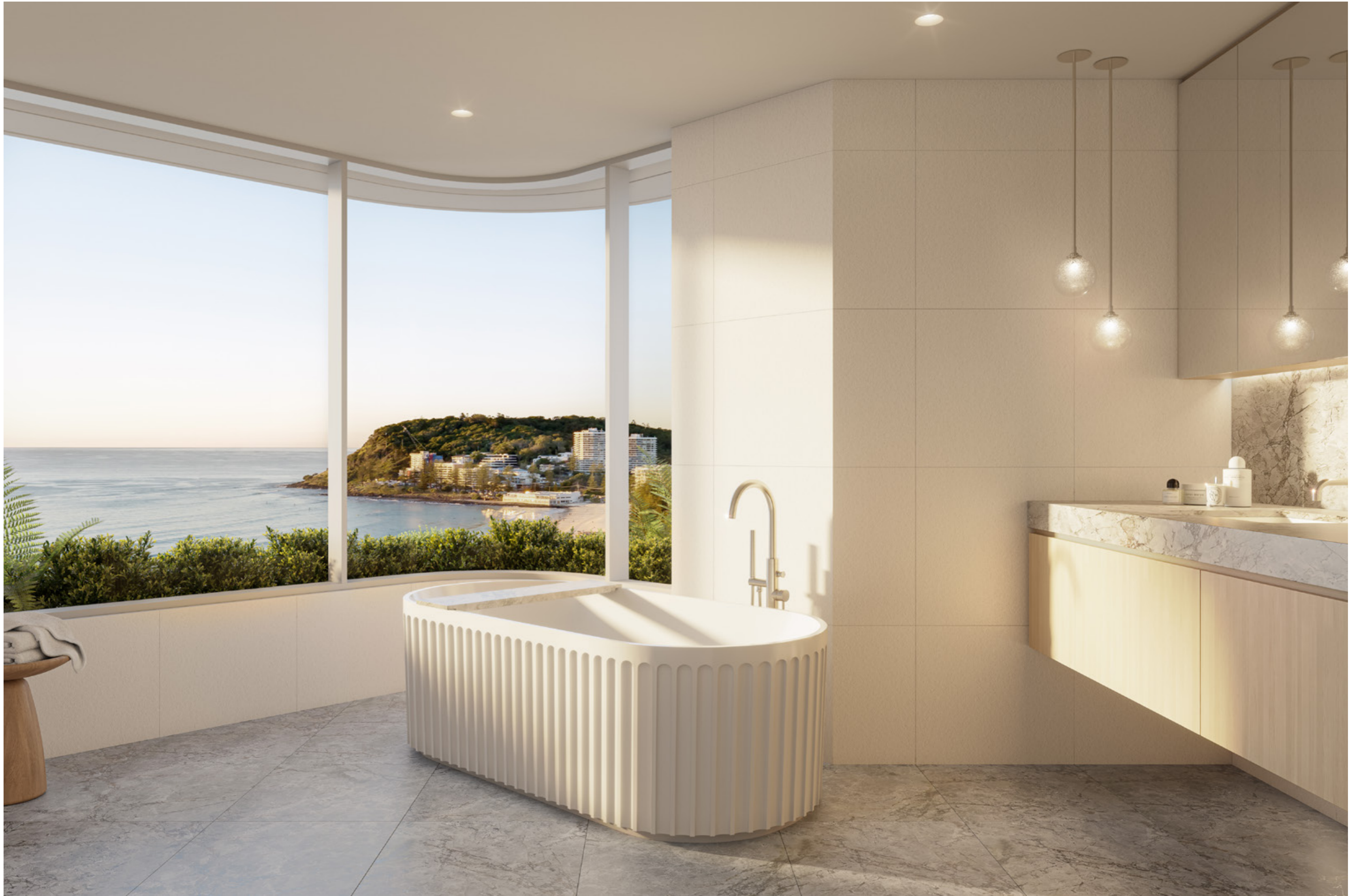
Artist impression only. The final product may differ. Image shows penthouse master ensuite. Refer to back page.