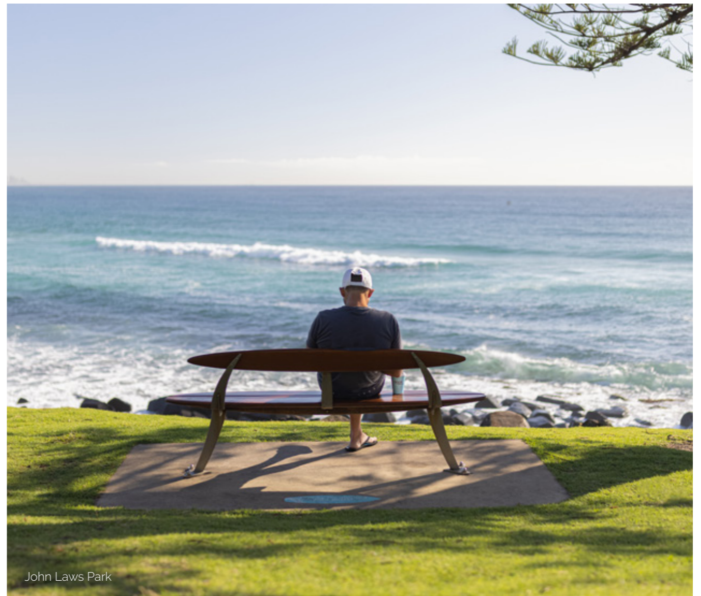
John Laws Park