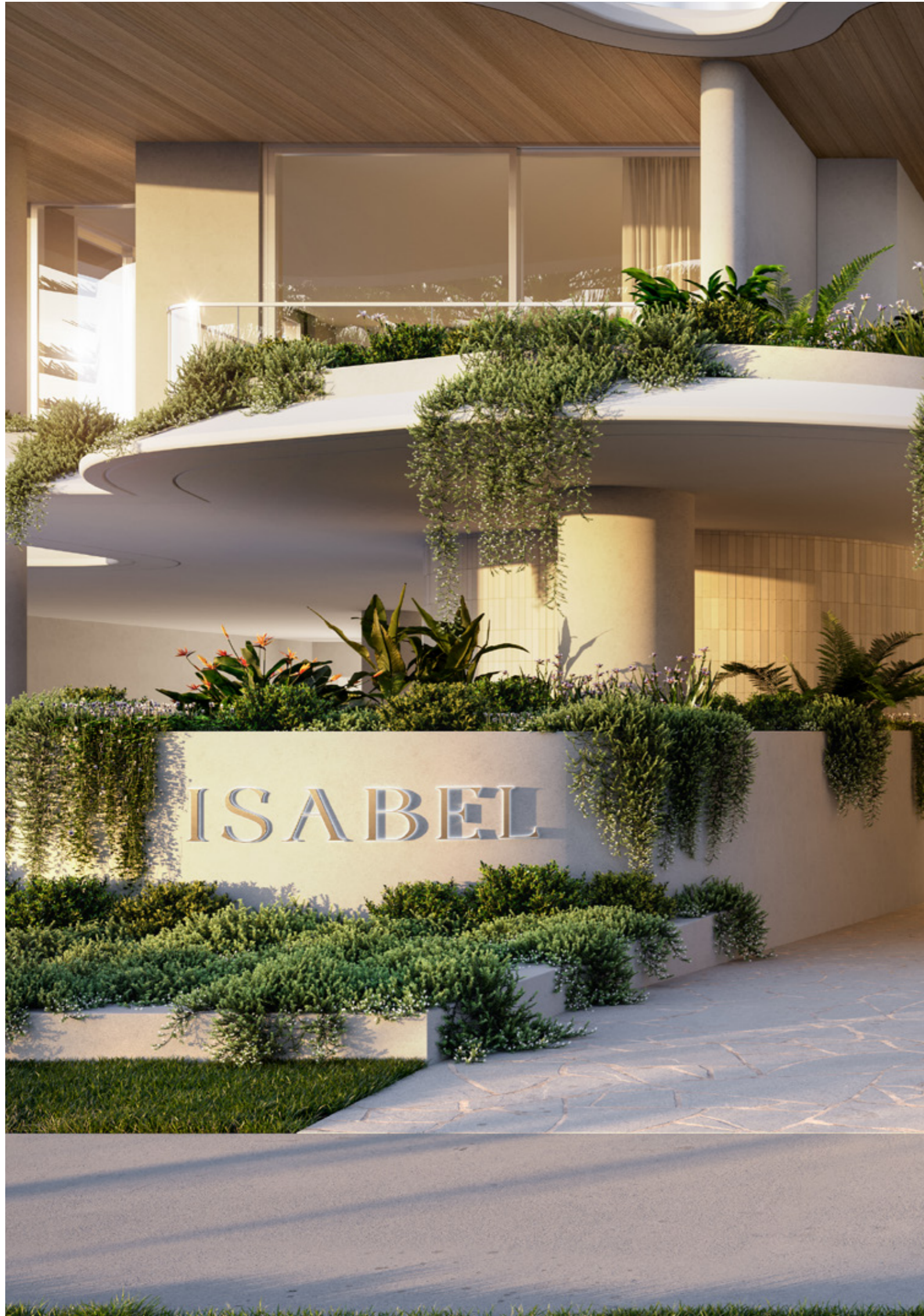
Artist impression only. The final product may differ. Landscaping indicative only. Refer to back page.