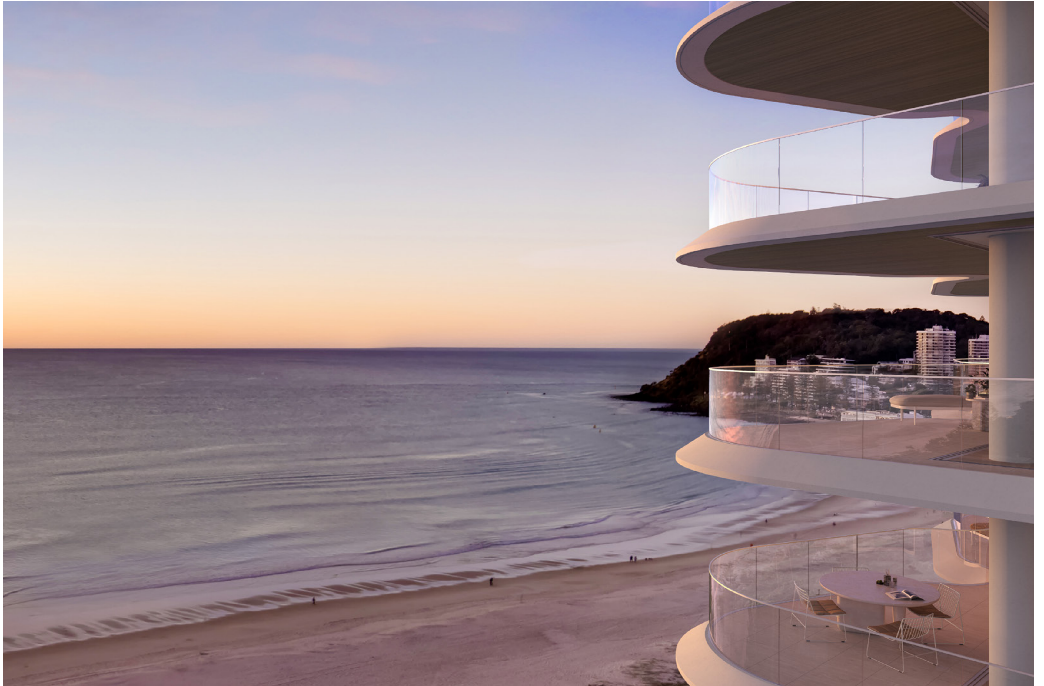
Artist impression only. The final product may differ. Refer to back page. Image features B&B Italia Tobi-Ishi Outdoor Table by Edward Barber & Jay Osgerby, available from Space.