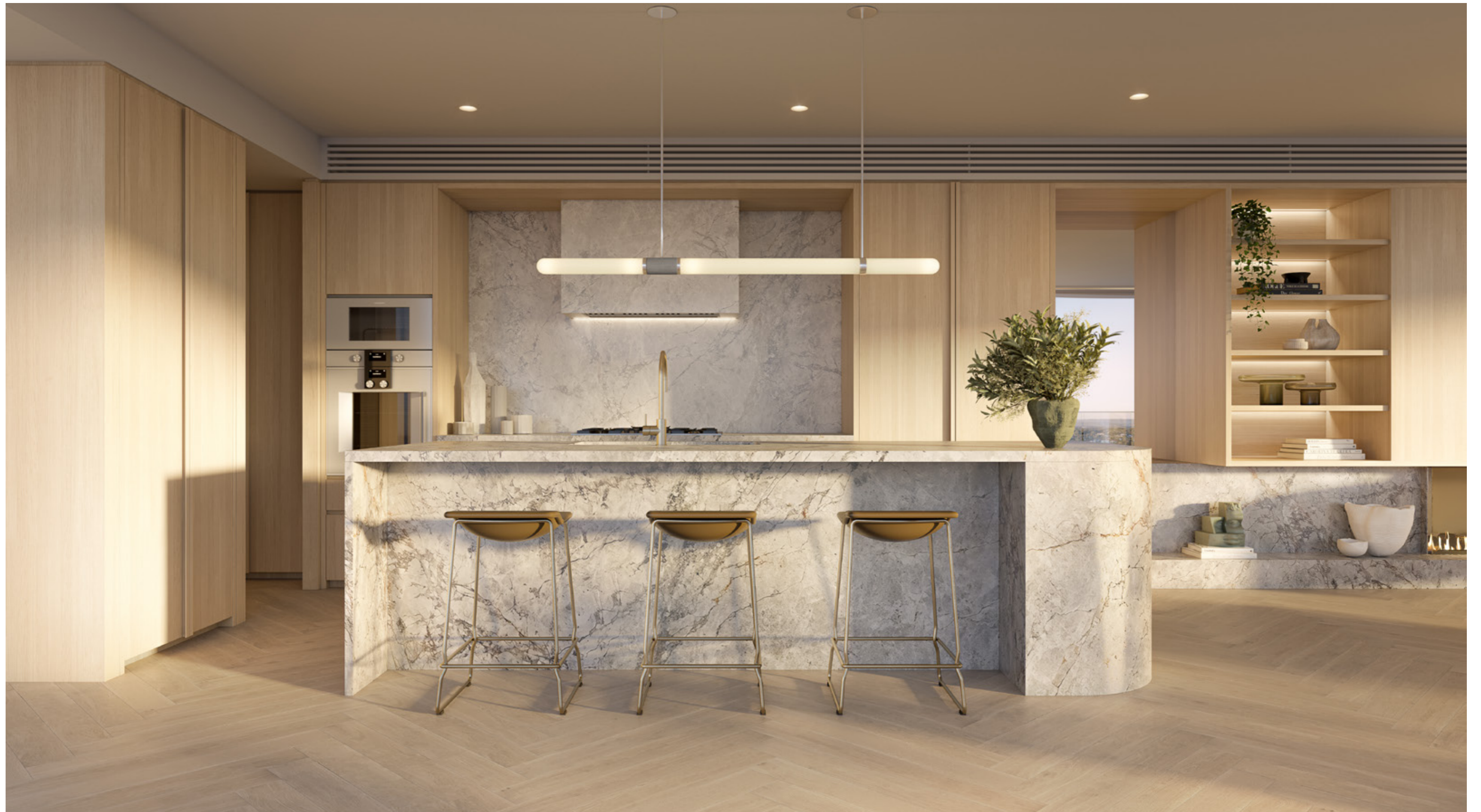
Artist impression only. The final product may differ. Image shows penthouse kitchen and living. Refer to back page. Image features Viccarbe Last Minute High Stool by Patricia Urquiola and Clay Objects by Paola Paronetto. Listed items are available from Space.