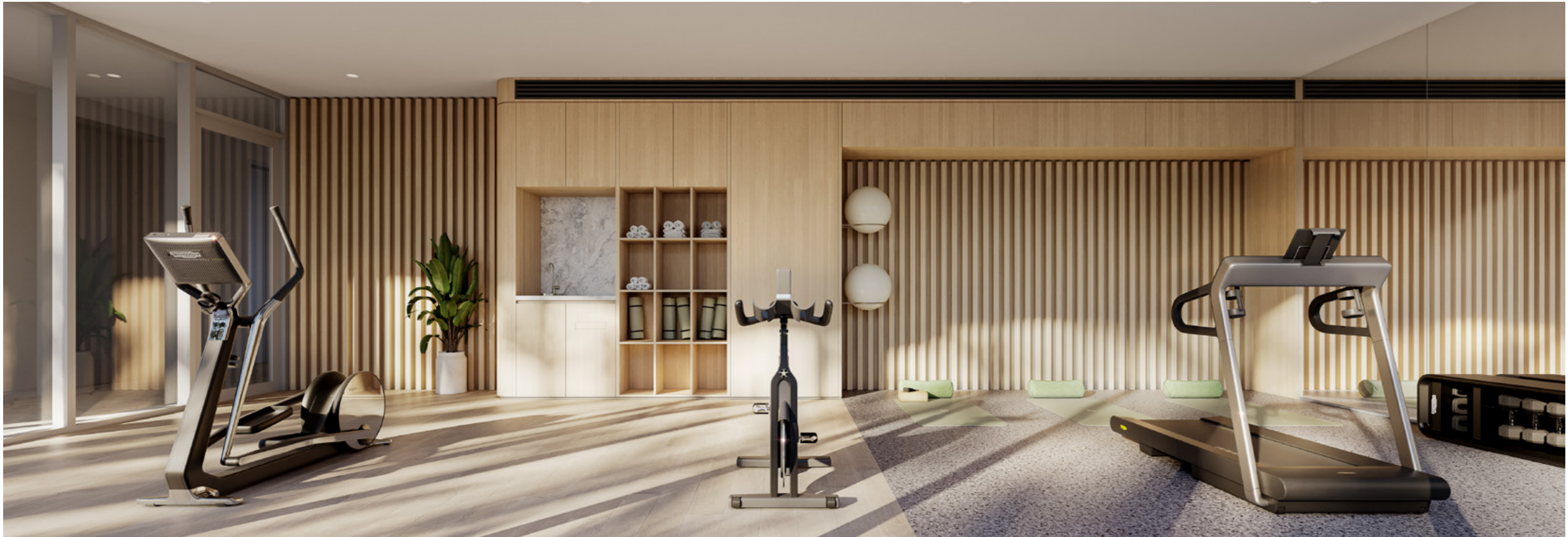
Artist impression only. The final product may differ. Refer to back page.