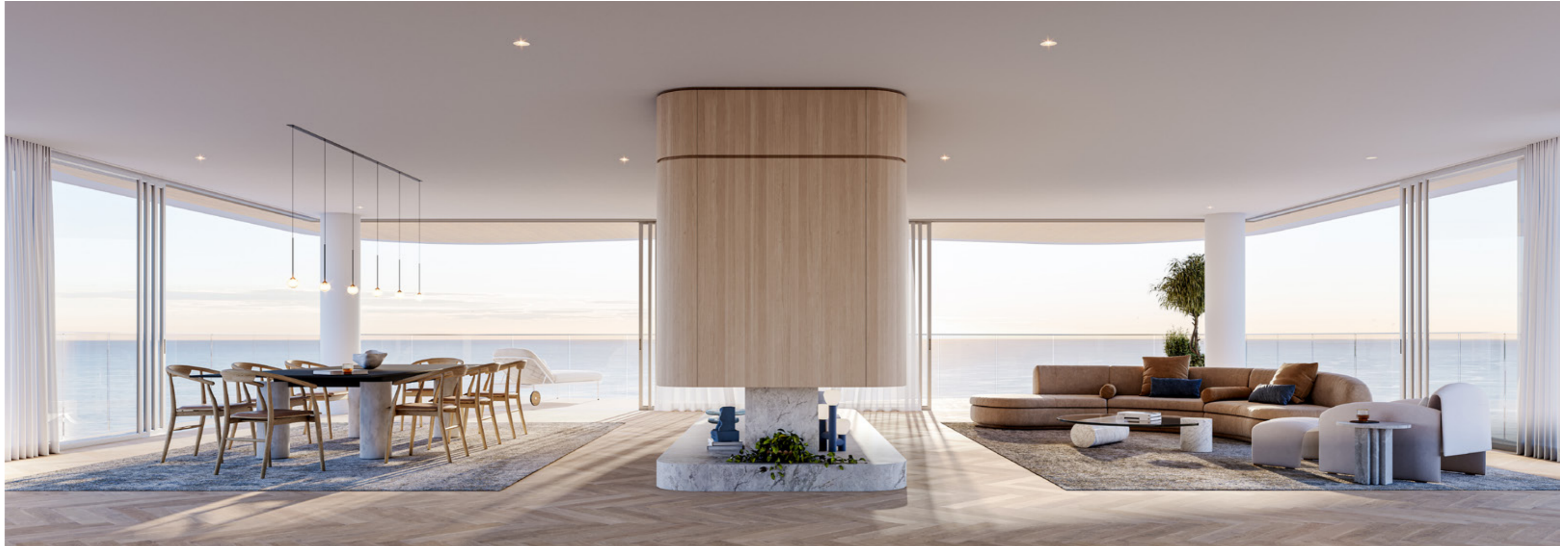
Artist impression only. The final product may differ. Image shows full-floor dining, living, and balcony with dining lighting upgrade shown. Refer to back page. Image features Jens Sedie dining chair by Antonio Citterio, Le Club Armchair by Poliform, Verre Particulier Coffee Table by Studiopepe, Scalea 45 small table by Bernhardt & Vella, and Piaf sofa by Baxter P. Listed items are available from Space.