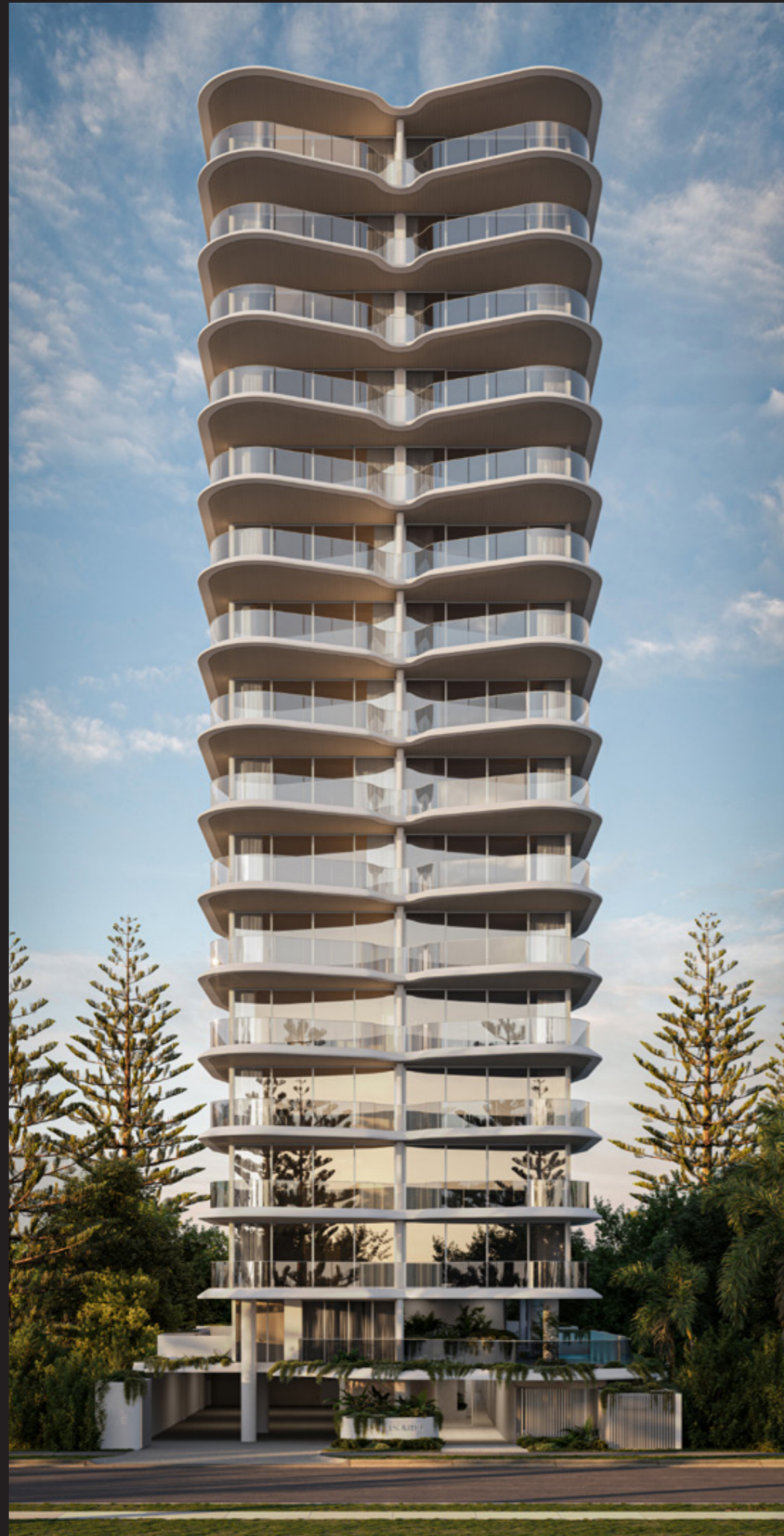
Artist impression only. The final product may differ. Landscaping indicative only. Refer to back page.