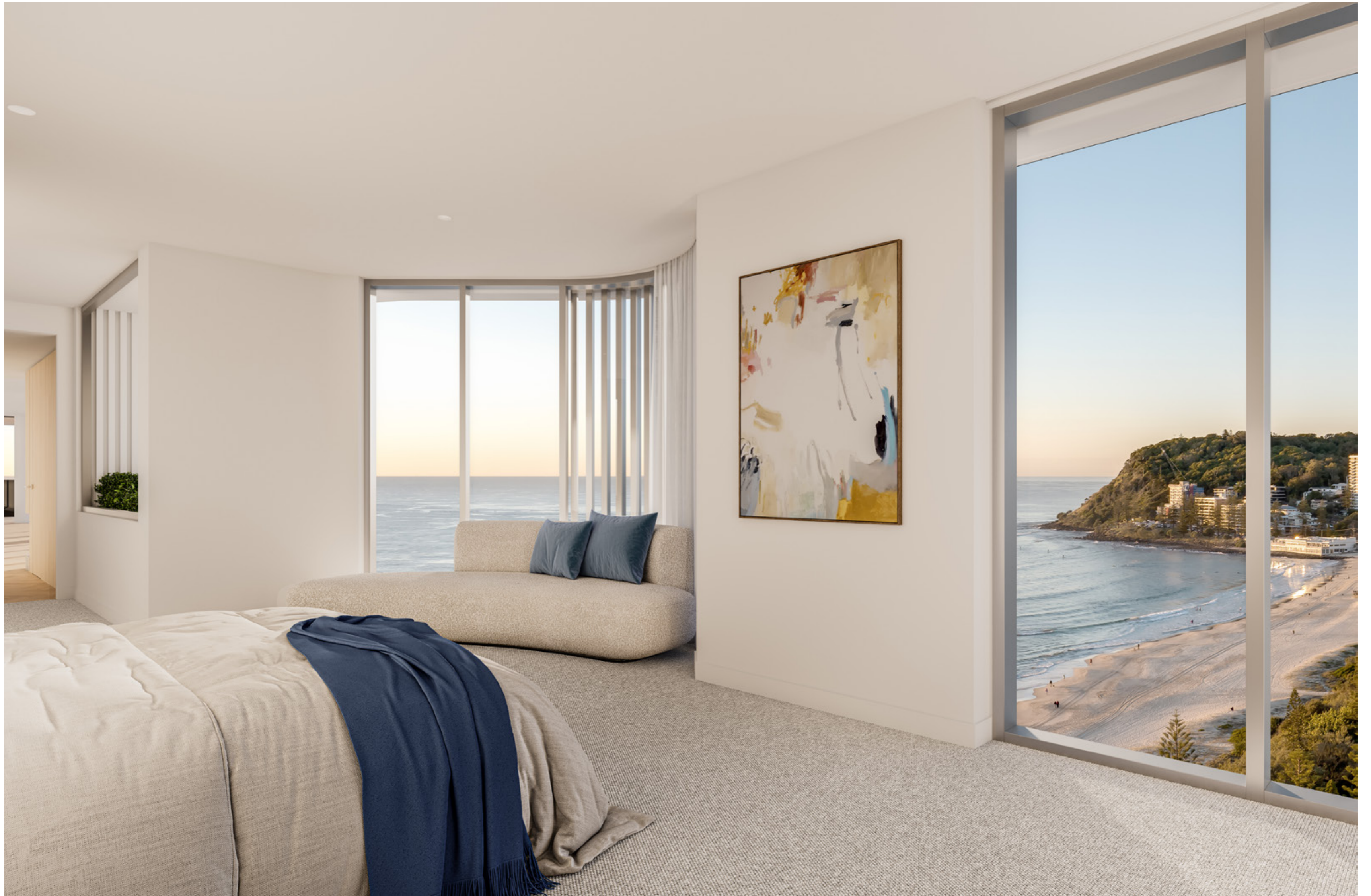
Artist impression only. The final product may differ. Image shows full-floor master bedroom. Refer to back page. Image features Audrey sofa by Massimo Castagna, available from Space.