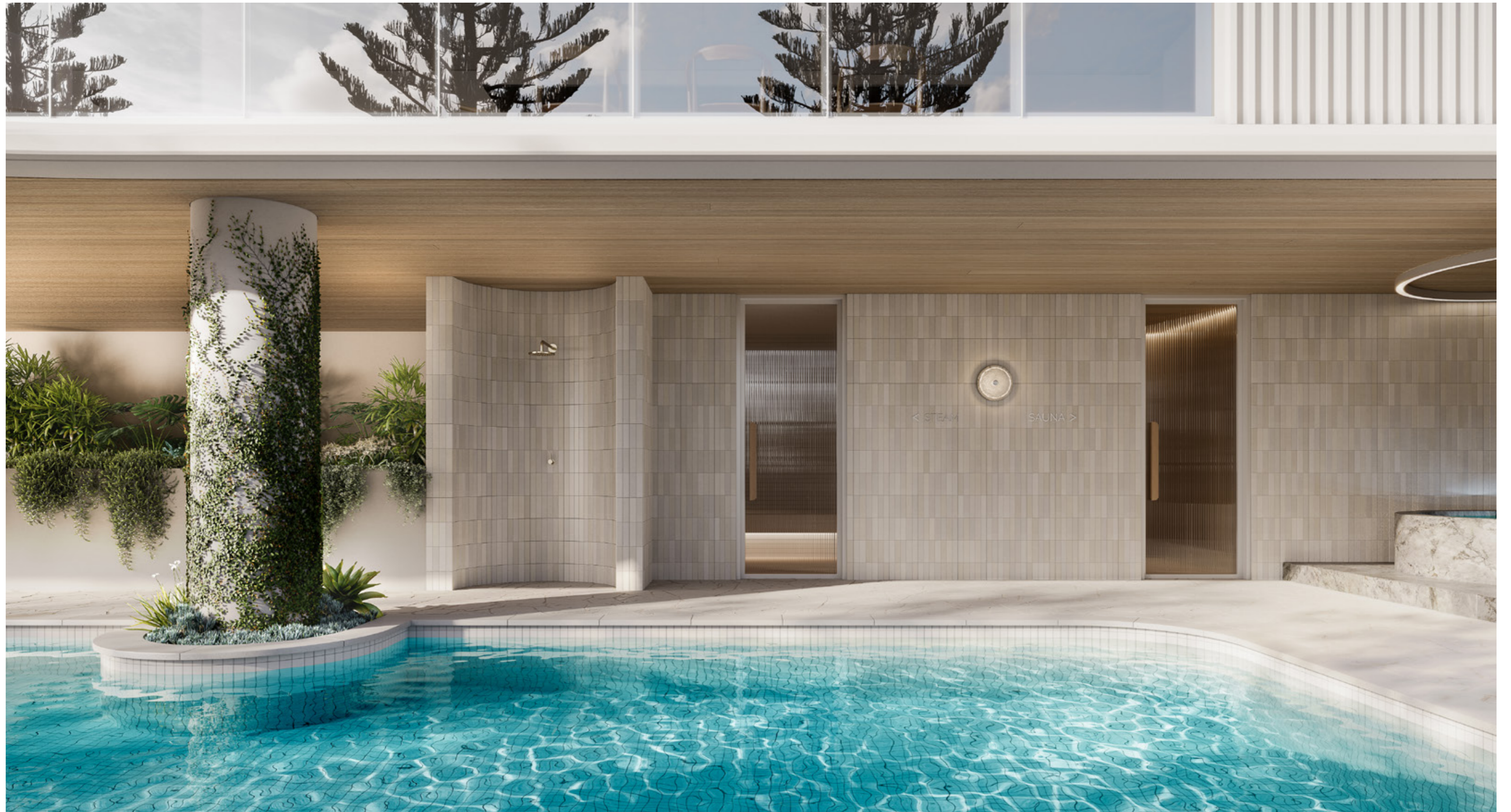
Artist impression only. The final product may differ. Landscaping indicative only. Refer to back page.