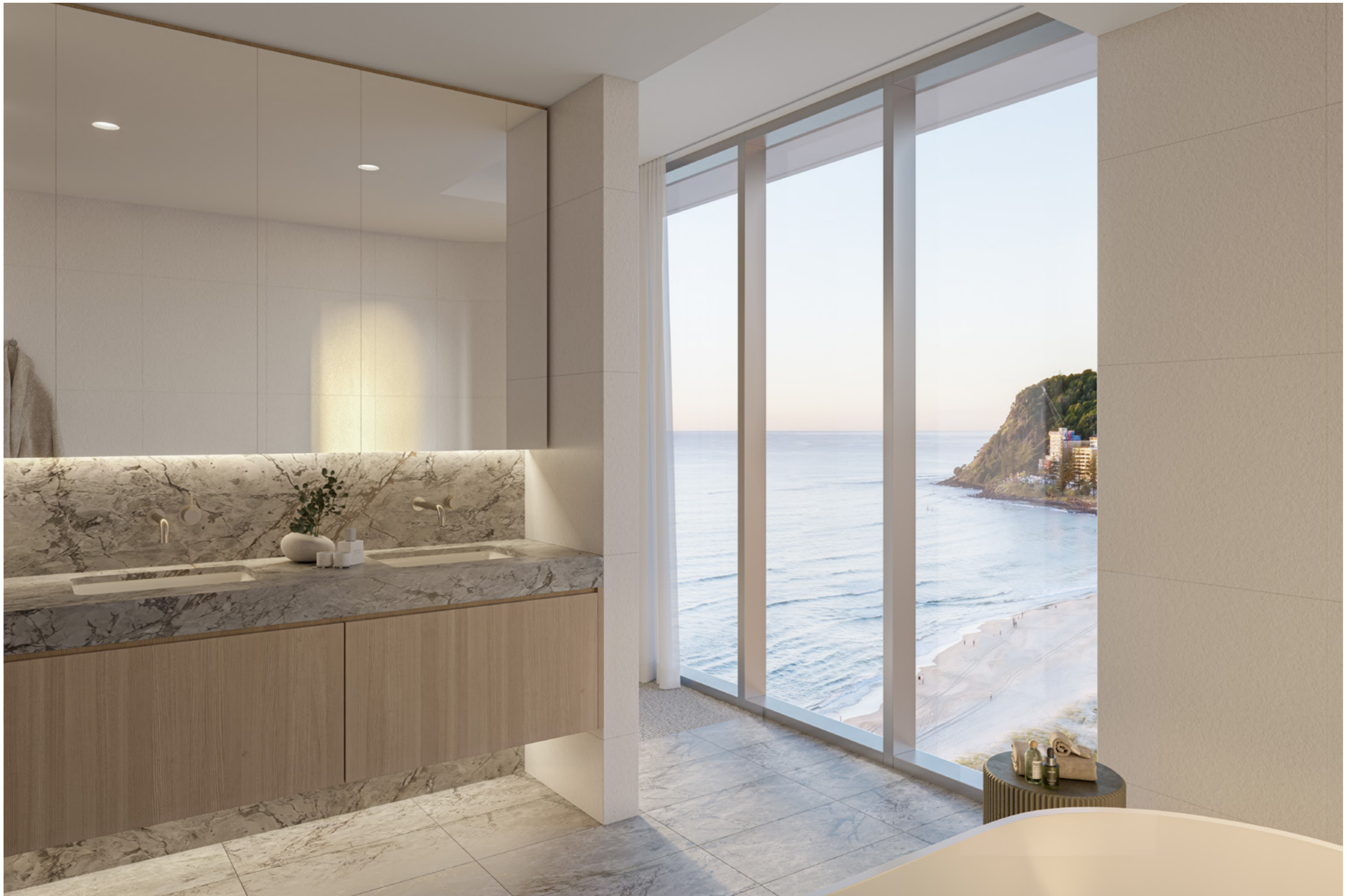
Artist impression only. The final product may differ. Image show half-floor master ensuite. Refer to back page.