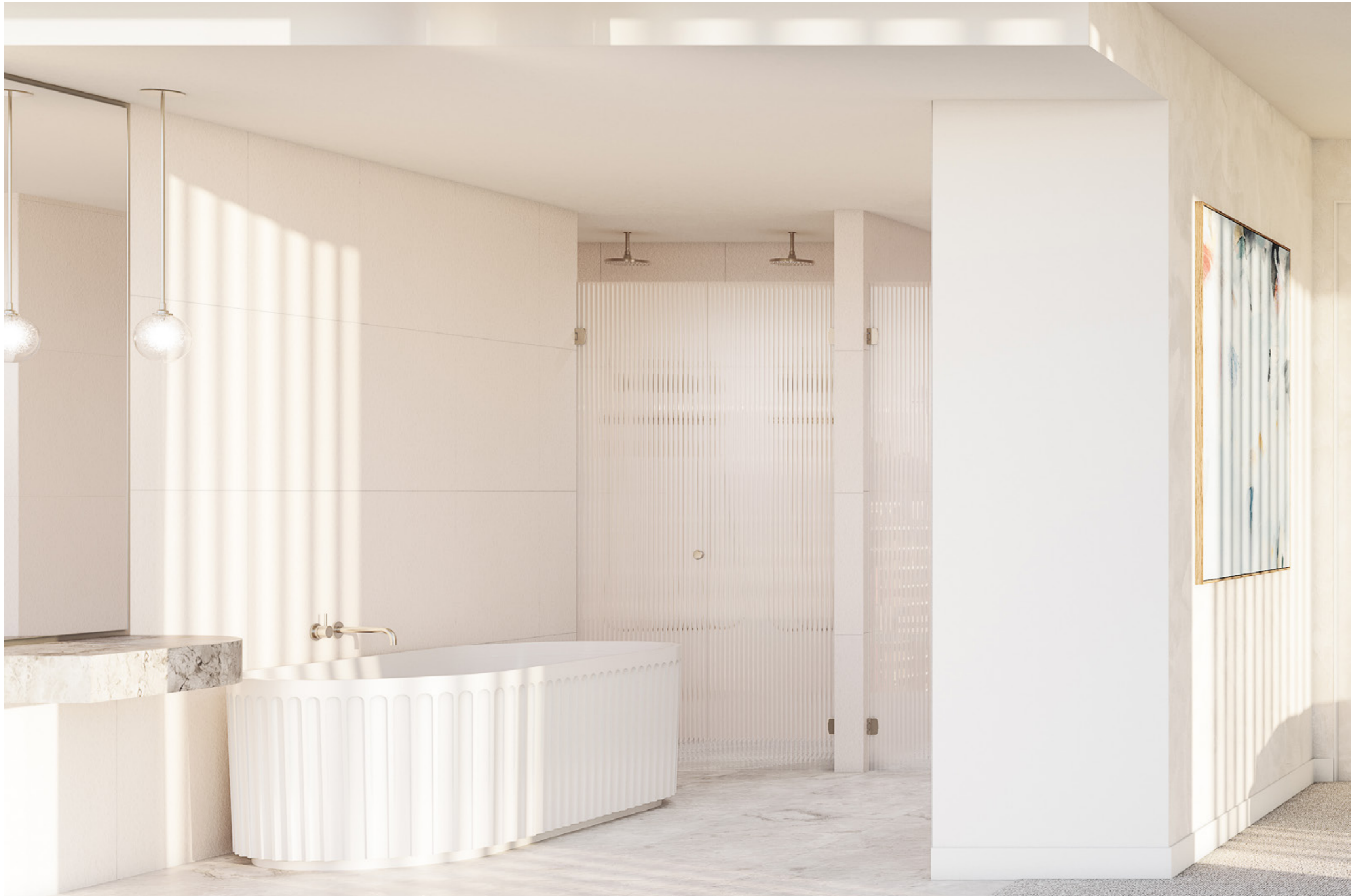
Artist impression only. The final product may differ. Image shows full-floor master ensuite. Refer to back page.