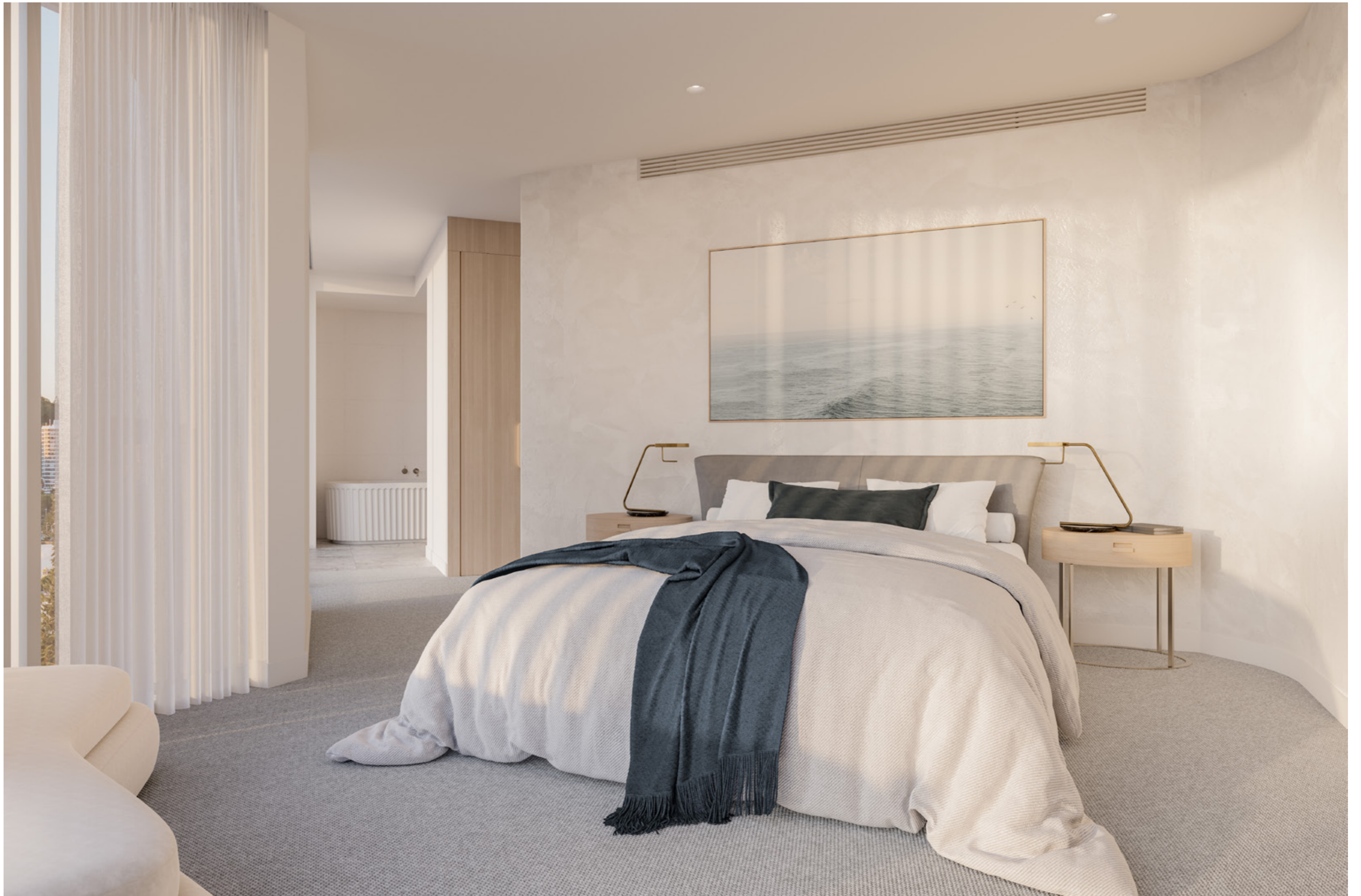
Artist impression only. The final product may differ. Image shows half-floor master bedroom and ensuite. Refer to back page. Image features Febo bed by Max Alto, Amphora bedside table by Max Alto, Lamp Blade by Baxter P, and Apollo sofa by Max Alto. Listed items are available from Space.