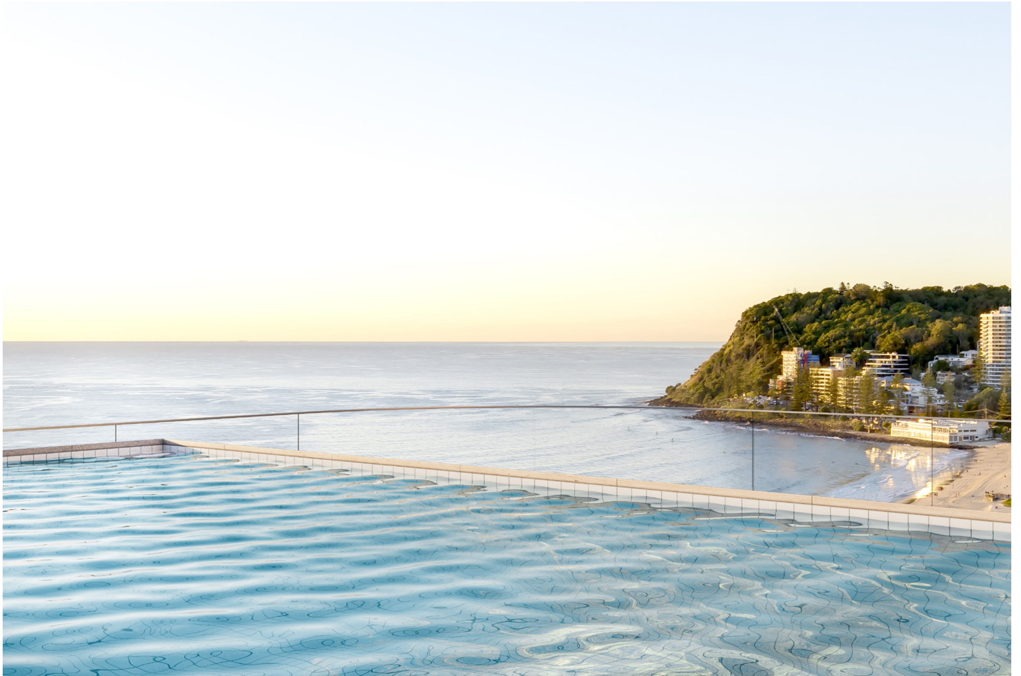
Artist impression only. The final product may differ. Image shows penthouse pool. Refer to back page.