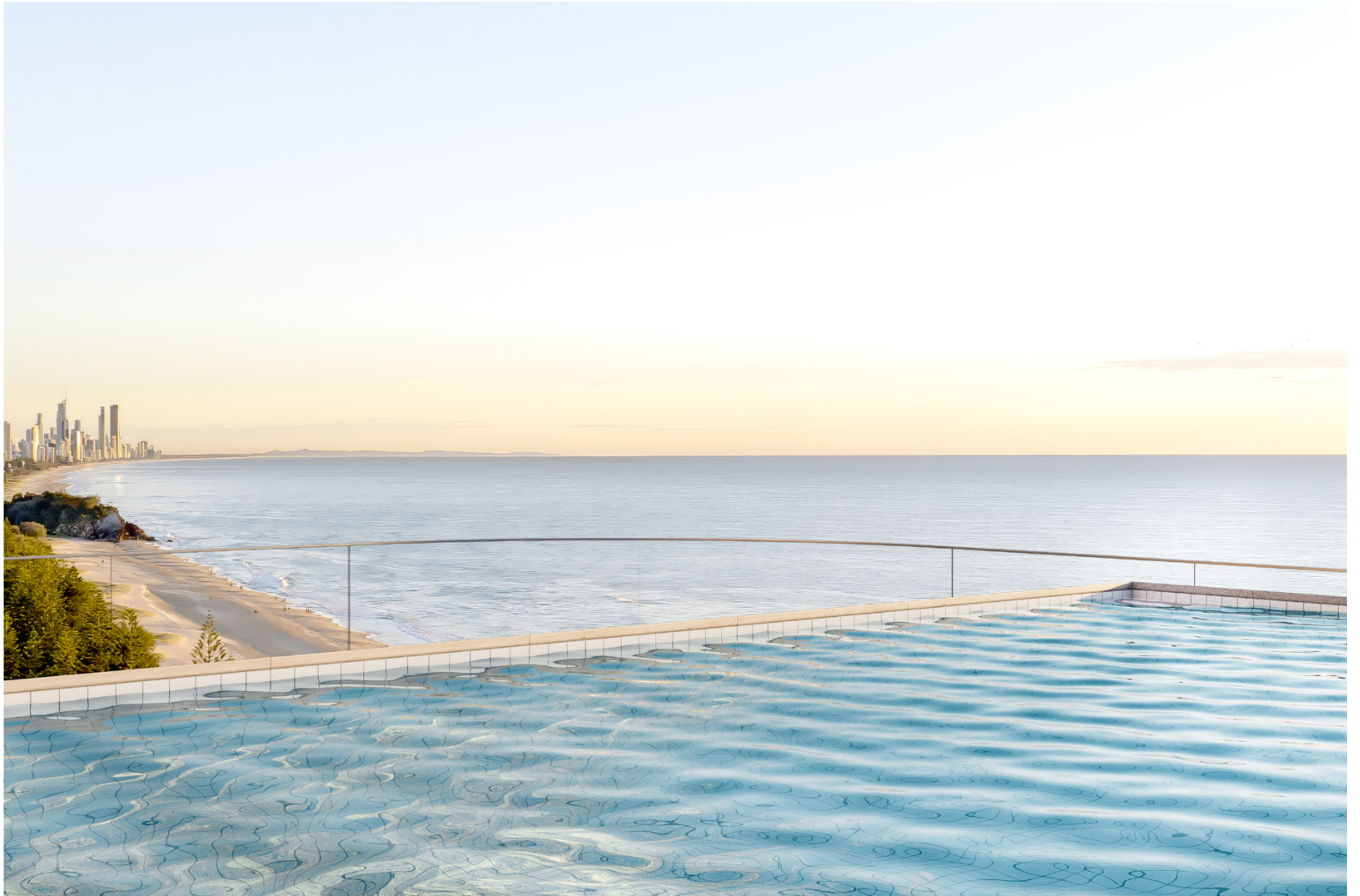
Artist impression only. The final product may differ. Image shows penthouse pool. Refer to back page.