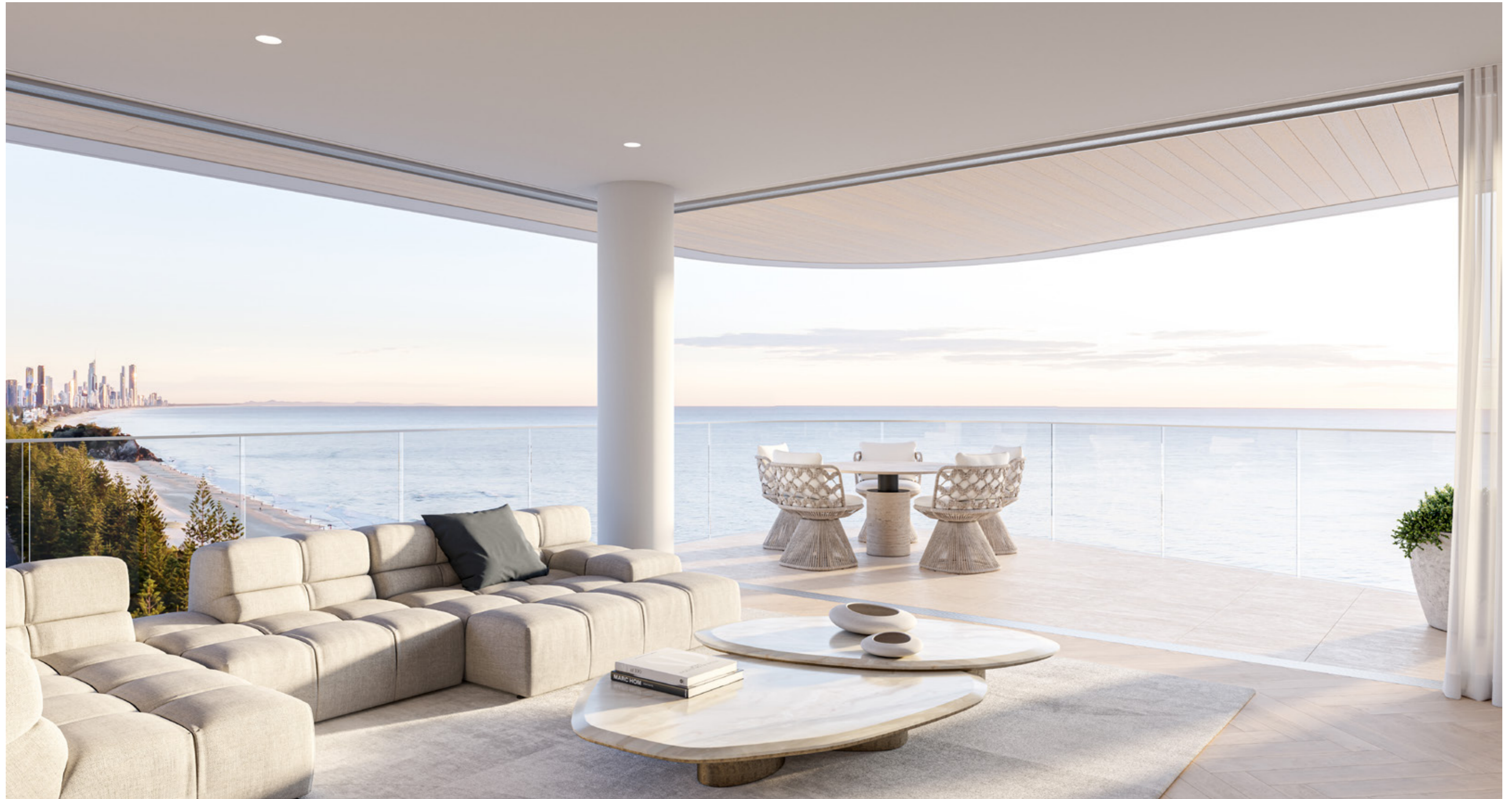
Artist impression only. The final product may differ. Image shows half-floor living and balcony. Refer to back page. Image features B&B Italia Tufty-Time Sofa by Patricia Urquiola, Creso table by Lella & Massimo Vignelli, and Flair O' Outdoor chair by Monica Armani. Listed items are available from Space.