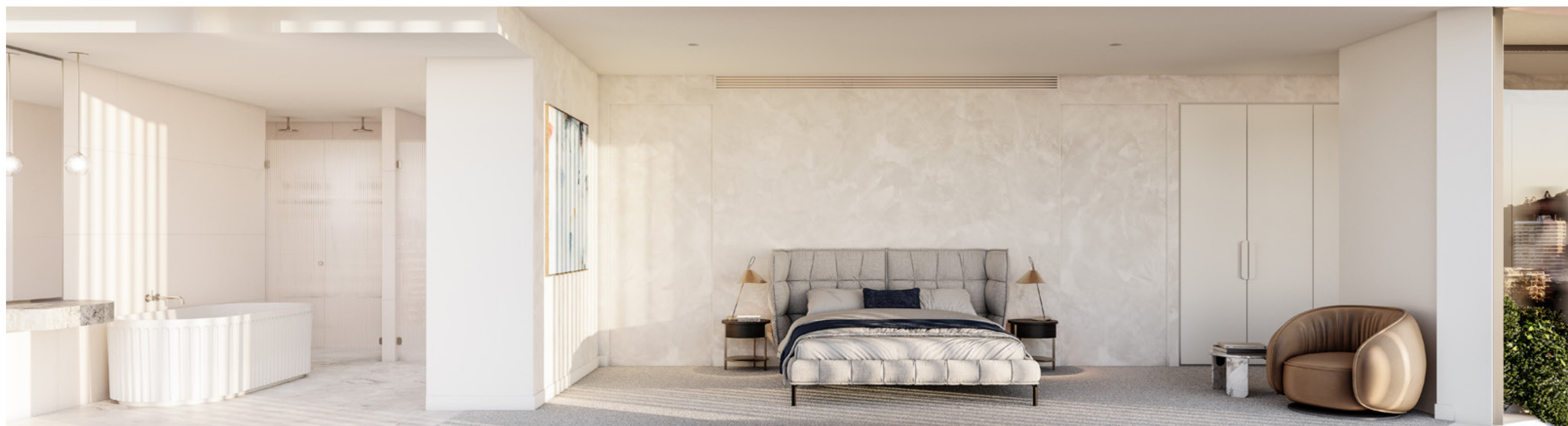
Artist impression only. The final product may differ. Image shows full-floor master bedroom and ensuite. Refer to back page. Image features B&B Italia Husk Bed by Patricia Urquiola, Amphora bedside table by Max Alto, Base Ghisa lamp by Luigi Caccia Dominioni and Leon occasional chair by Draga & Aurel. Listed items are available from Space.