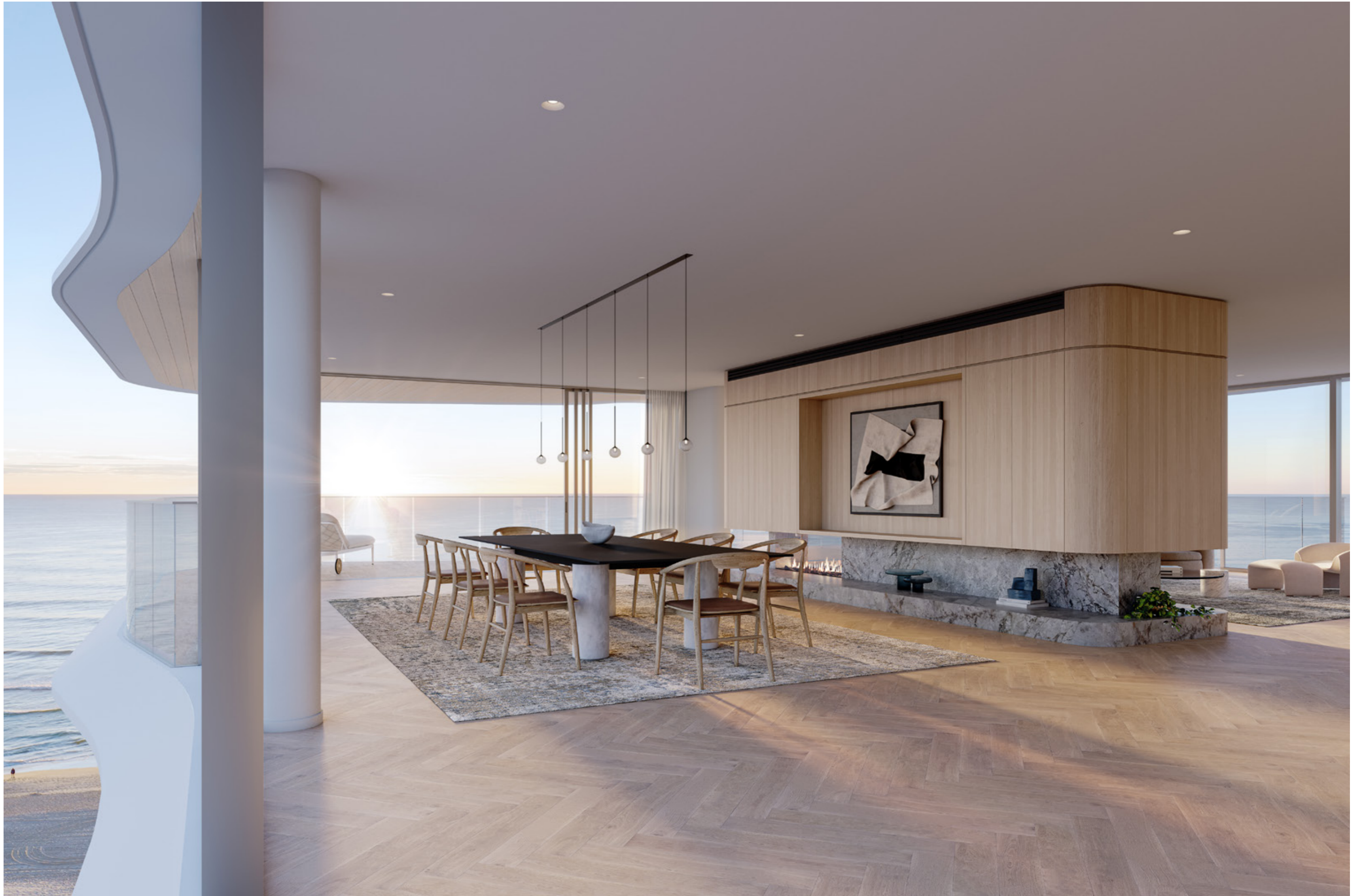
Artist impression only. The final product may differ. Image shows full-floor dining, living, and balcony with dining lighting upgrade shown. Refer to back page. Image features Jens Sedie dining chair by Antonio Citterio, available from Space.