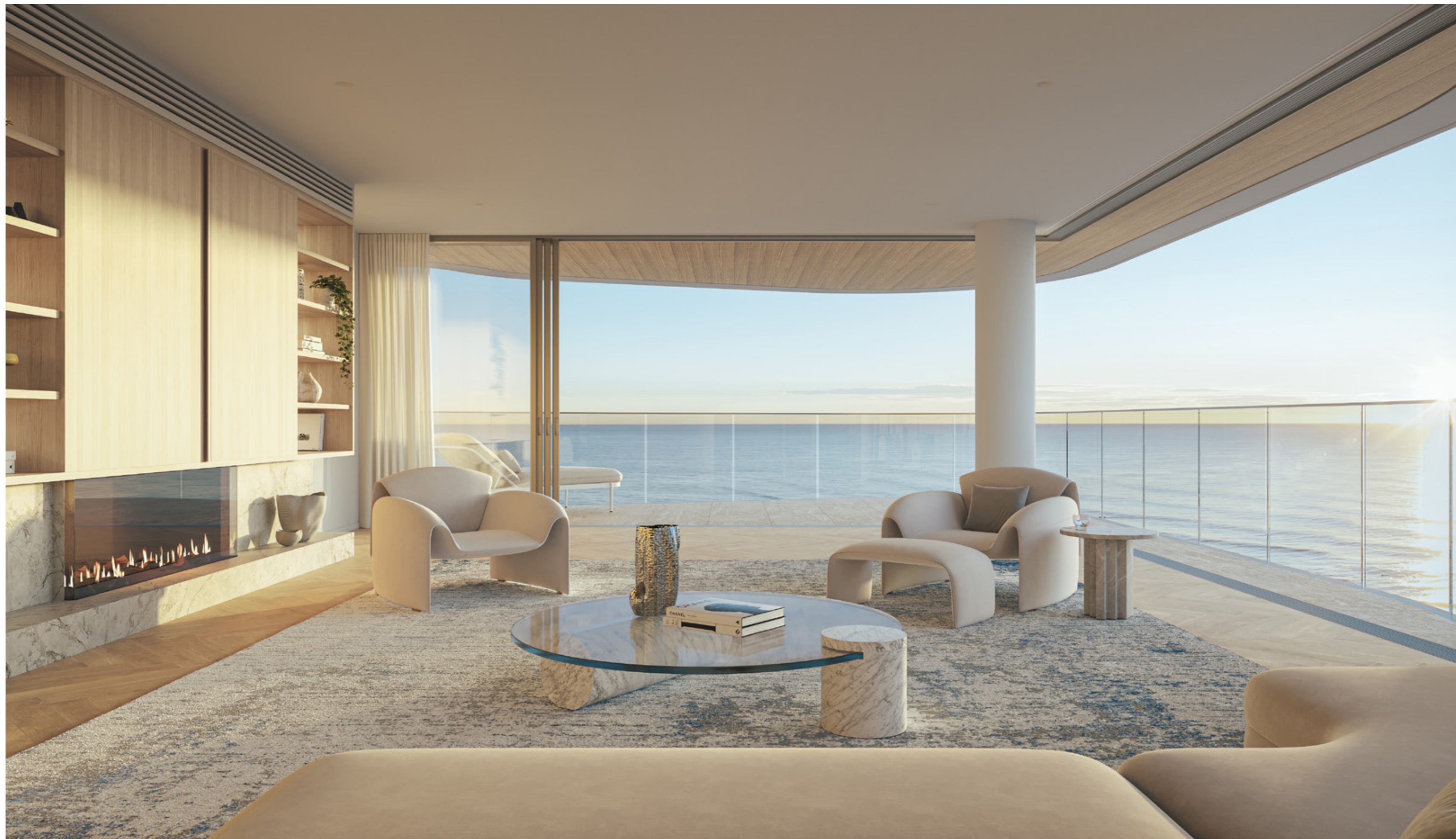
Artist impression only. The final product may differ. Image shows penthouse living and balcony. Refer to back page. Image features Le Club Armchair by Poliform, Verre Particulier Coffee Table by Studiopepe, Scalea 45 small table by Bernhardt & Vella, and Piaf sofa by Baxter P. Listed items are available from Space.