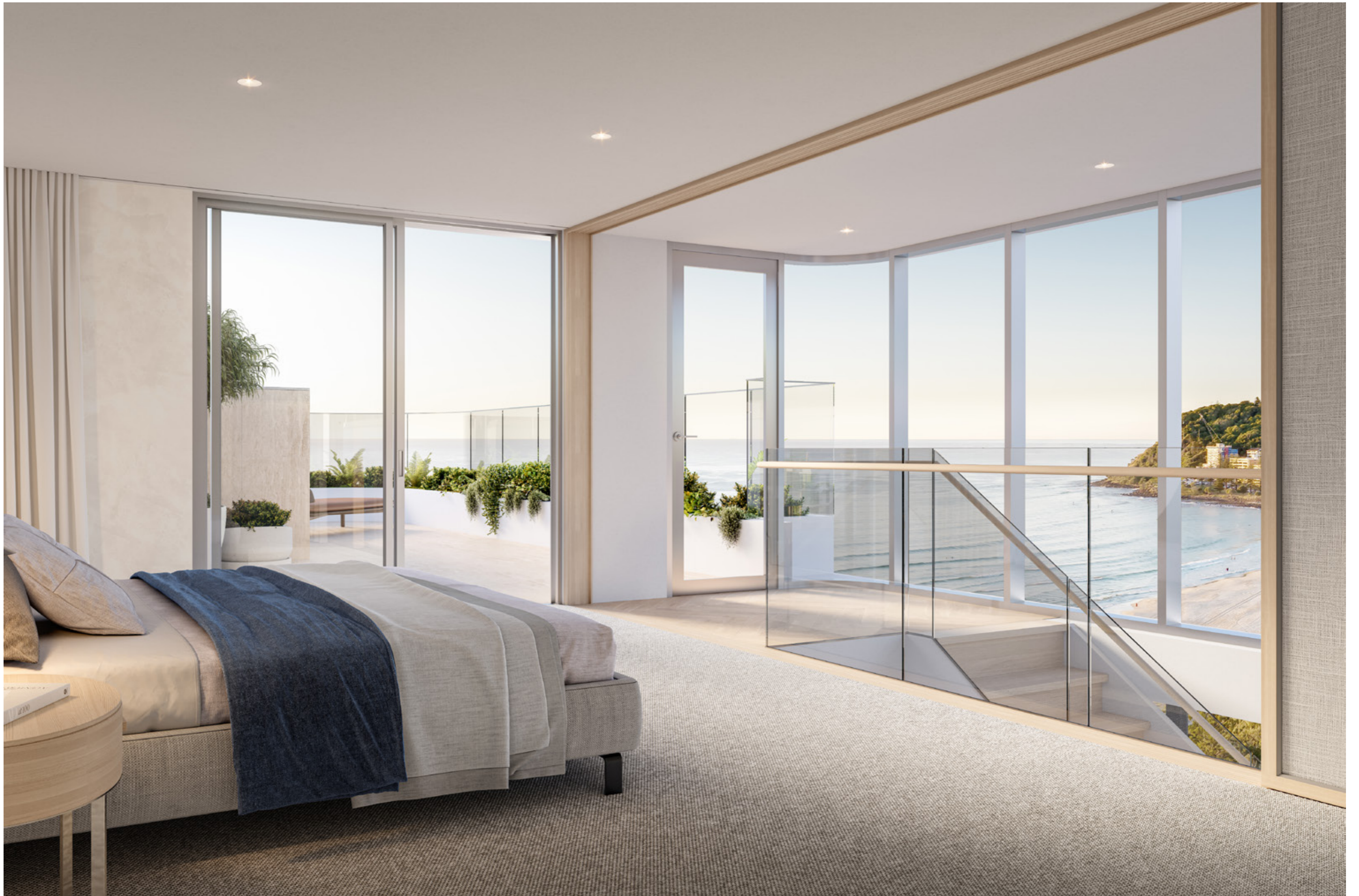
Artist impression only. The final product may differ. Image shows penthouse Master Bedroom. Refer to back page. Image features Amphora bedside table by Max Alto, available from Space.