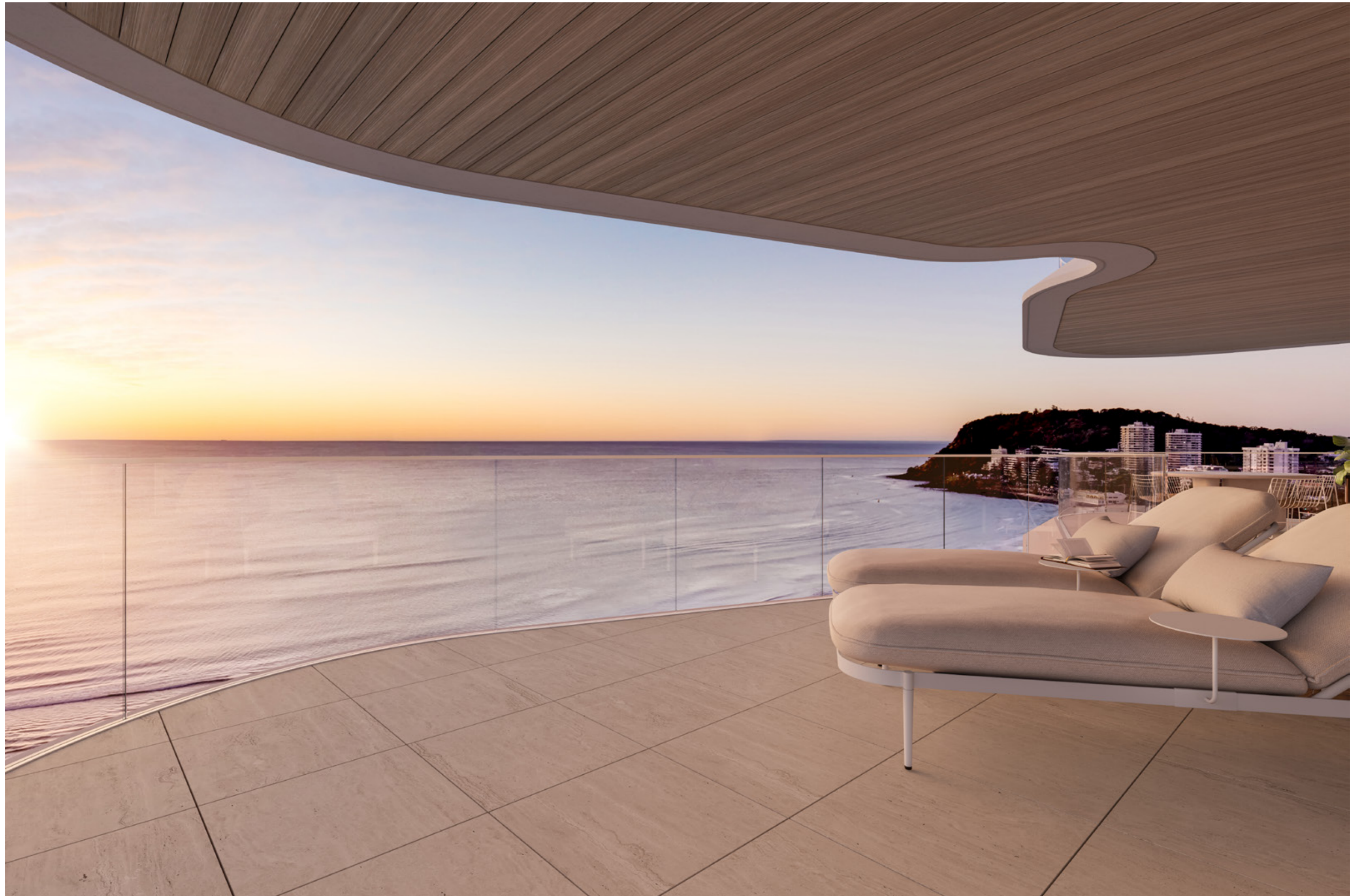
Artist impression only. The final product may differ. Image shows full-floor balcony. Refer to back page.