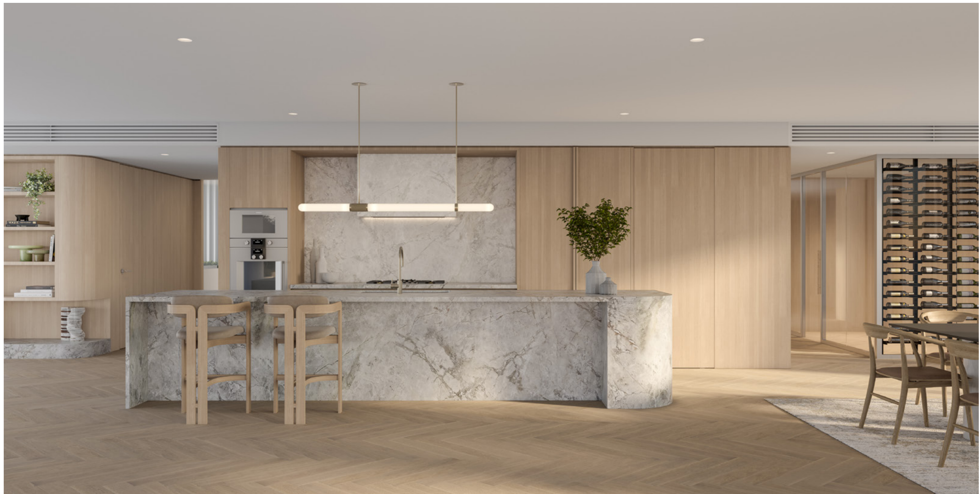
Artist impression only. The final product may differ. Image shows full-floor kitchen, living, and dining. Refer to back page. Image features 0419 stool by Studio G&R and Jens Sedie dining chair by Antonio Citterio. Listed items are available from Space.