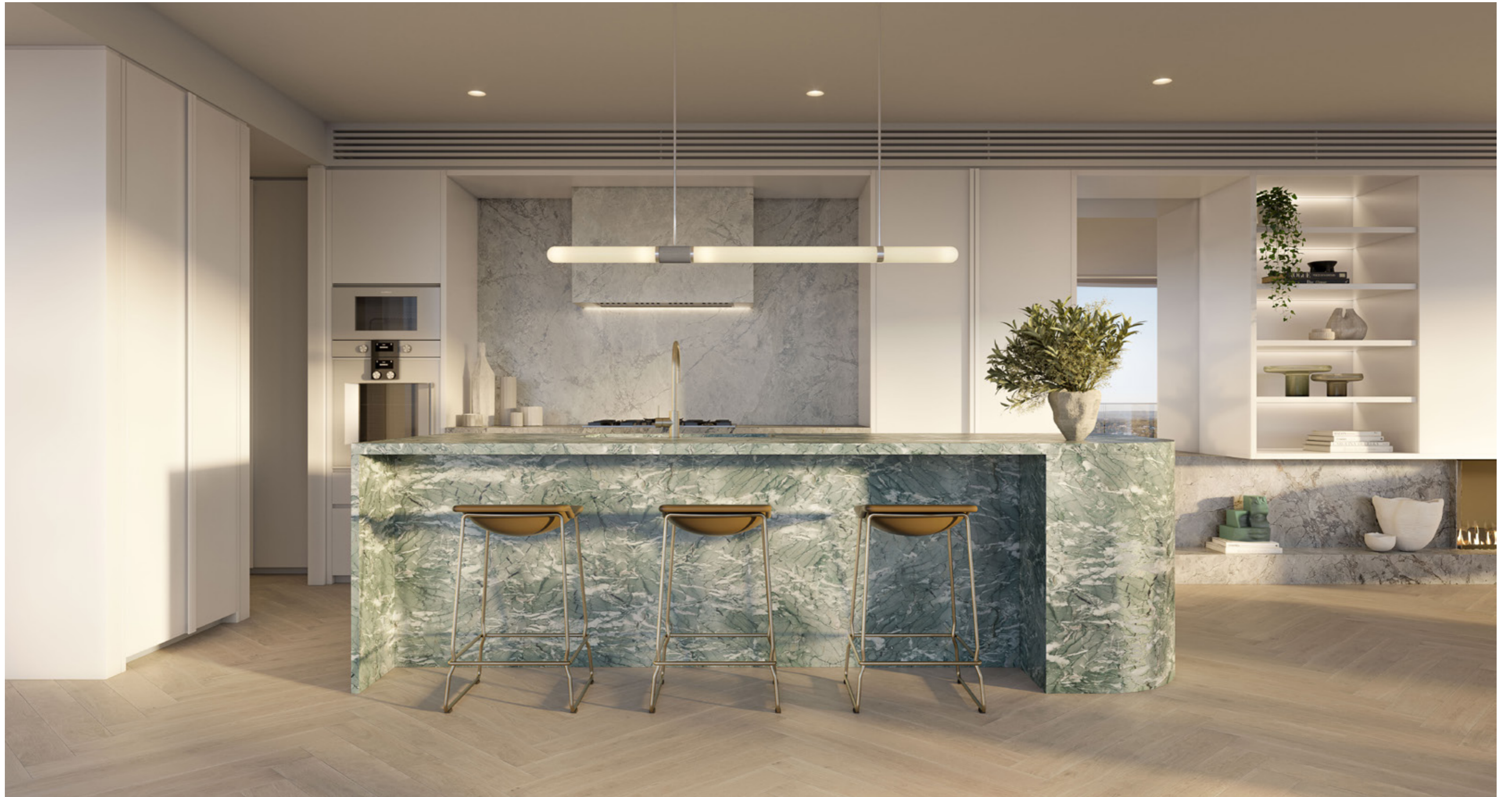
Artist impression only. The final product may differ. Image shows penthouse kitchen and living with optional colour selections. Refer to back page. Image features Viccarbe Last Minute High Stool by Patricia Urquiola and Clay Objects by Paola Paronetto. Listed items are available from Space.