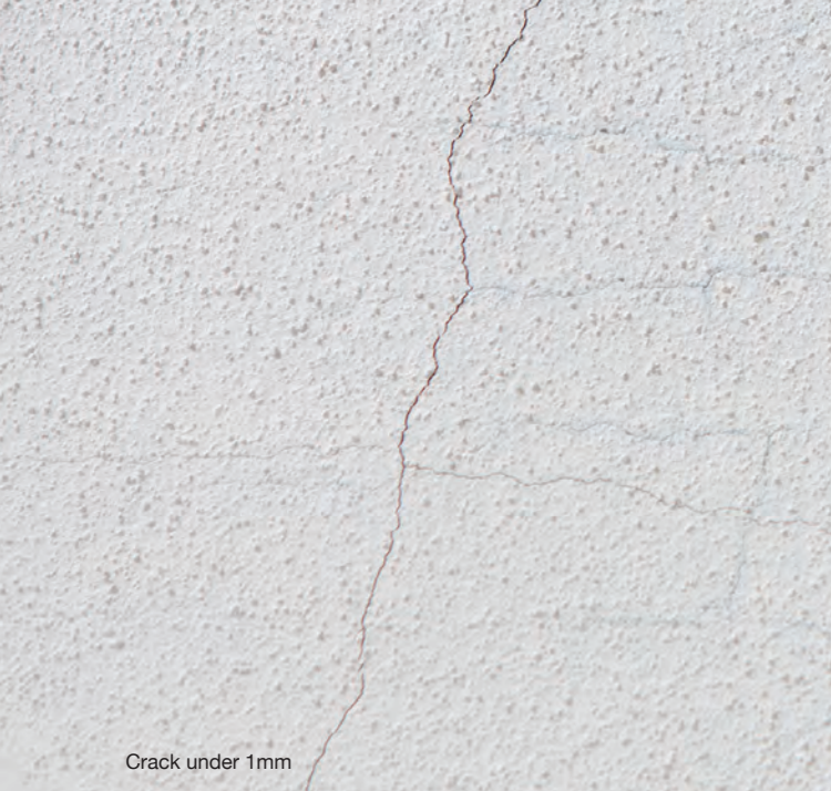
Crack under 1mm