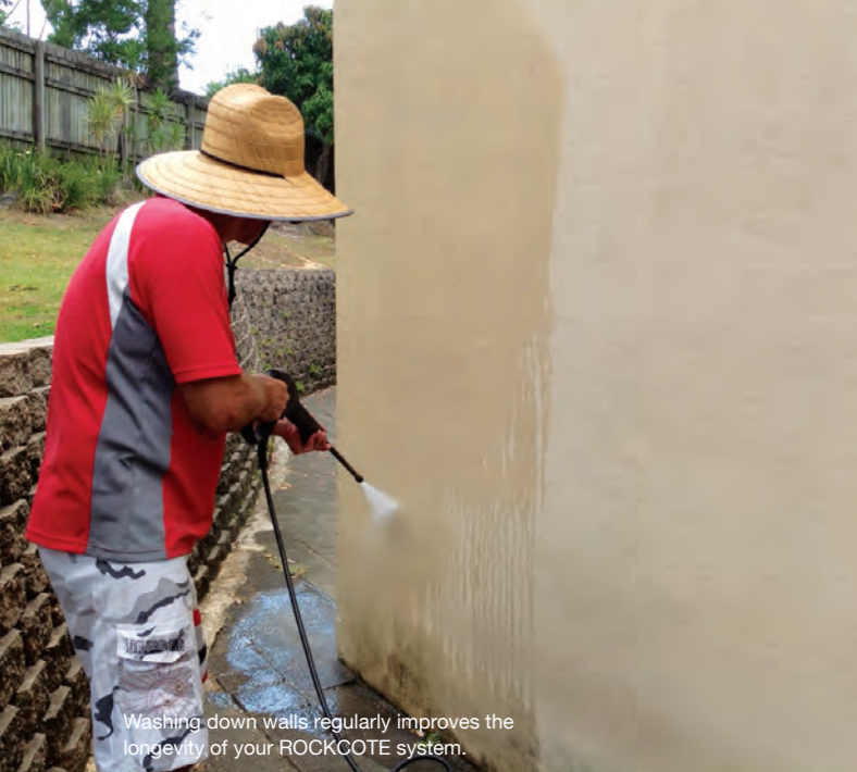
Washing down walls regularly improves the longevity of your ROCKCOTE system.