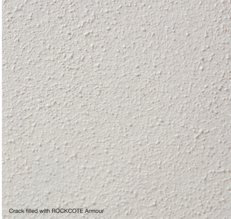
Crack filled with ROCKCOTE Armour