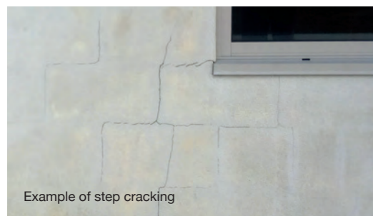
Example of step cracking