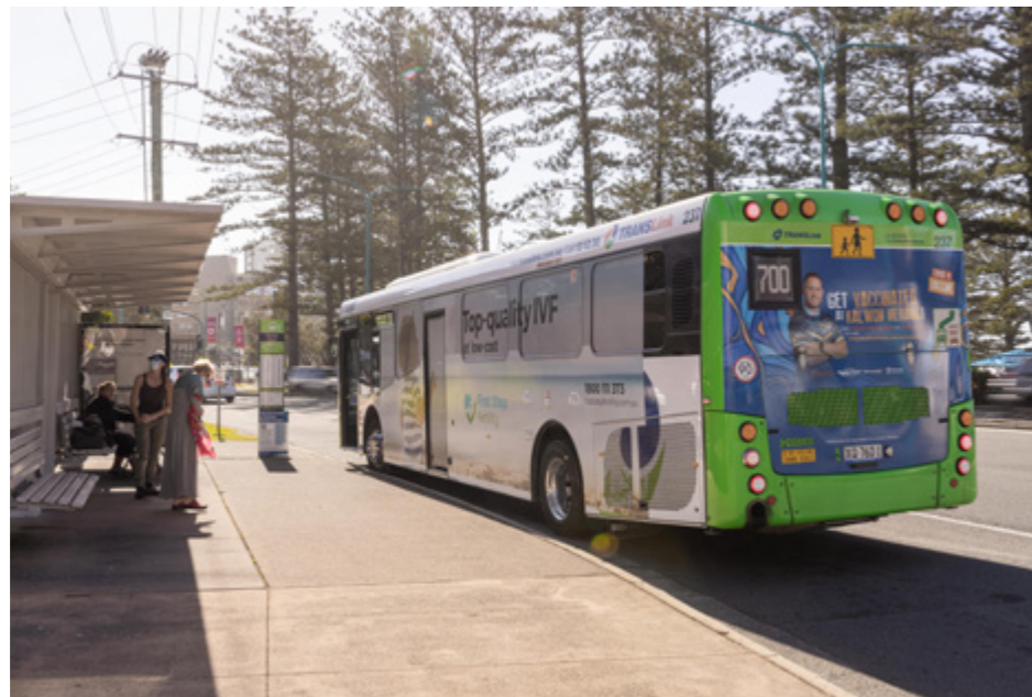
Burleigh Beach Bus Stop - 250m