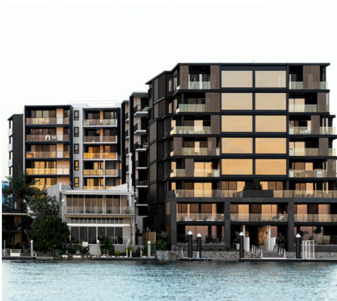
Avalon by Mosaic.