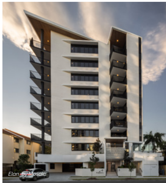
Elan by Mosaic.