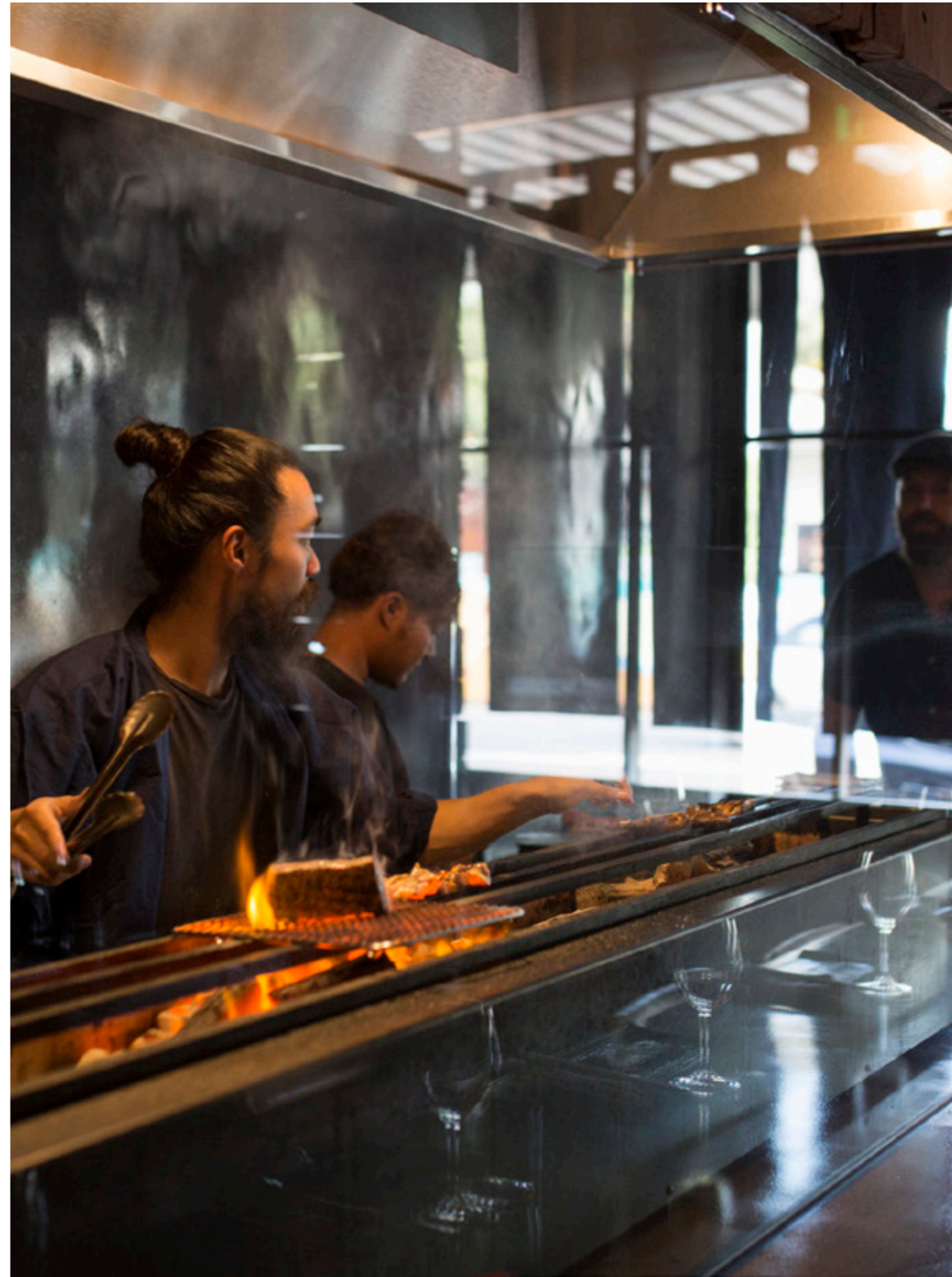
Iku Yakitori Bar – 250m