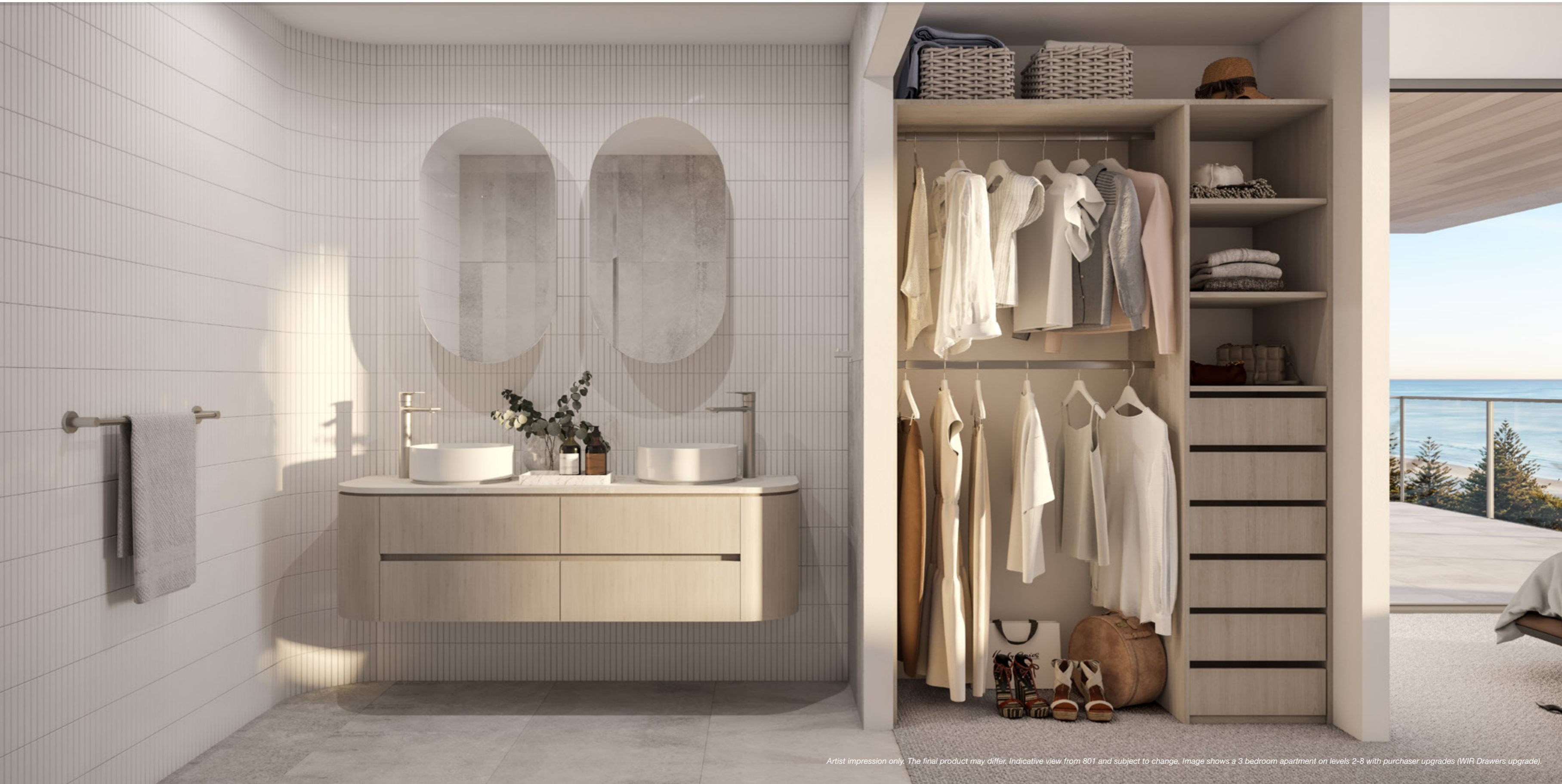
Artist impression only. The final product may differ. Indicative view from 801 and subject to change. Image shows a 3 bedroom apartment on levels 2-8 with purchaser upgrades (WIR Drawers upgrade).