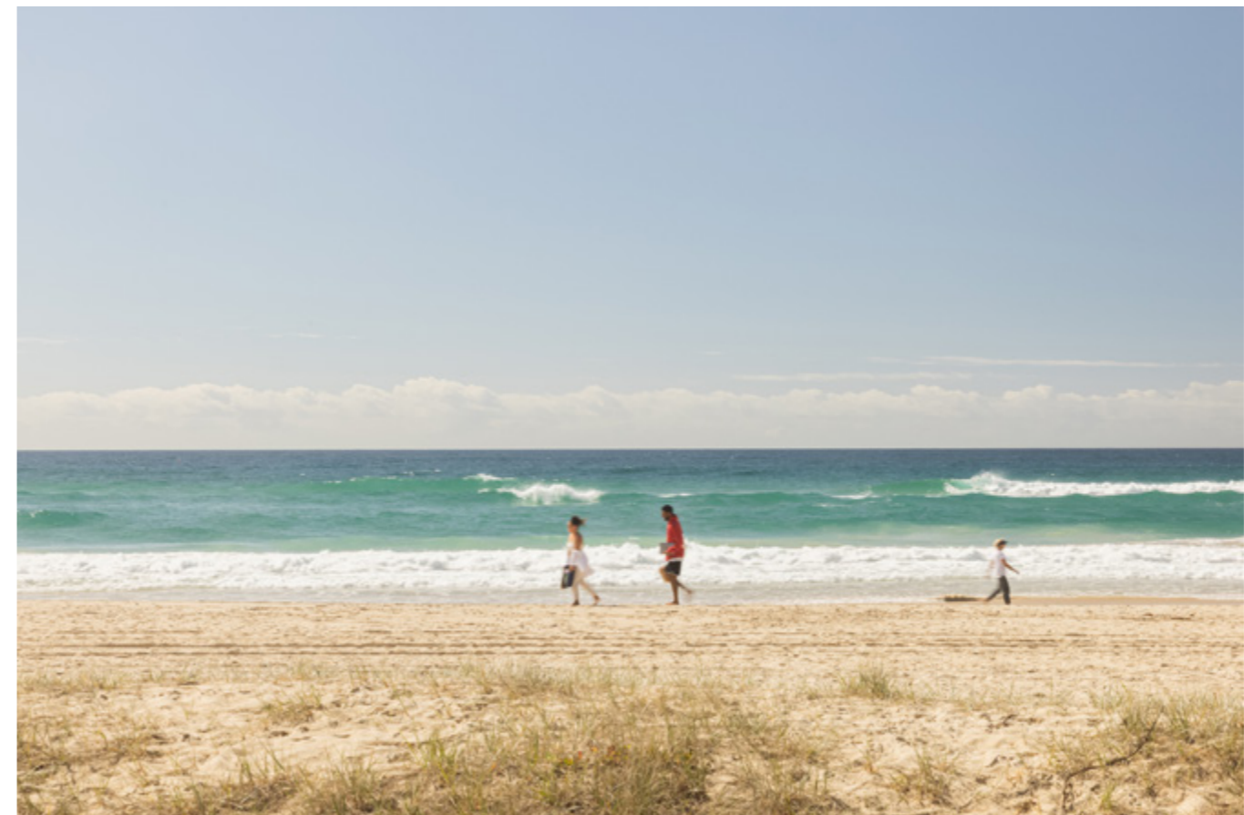
Burleigh Beach - 100m