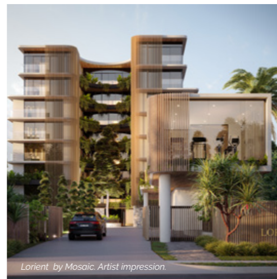
Lorient by Mosaic. Artist impression.