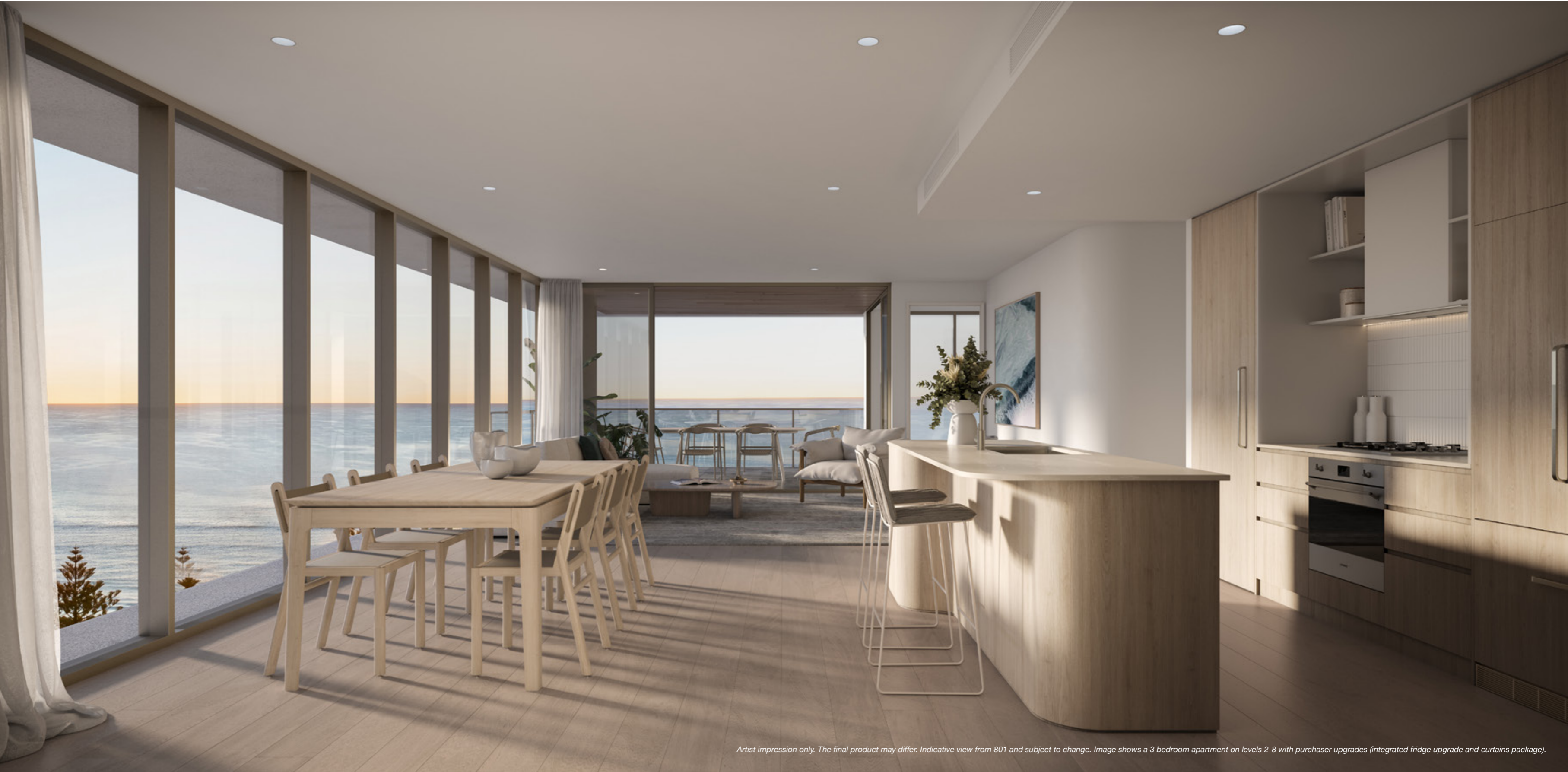
Artist impression only. The final product may differ. Indicative view from 801 and subject to change. Image shows a 3 bedroom apartment on levels 2-8 with purchaser upgrades (integrated fridge upgrade and curtains package).