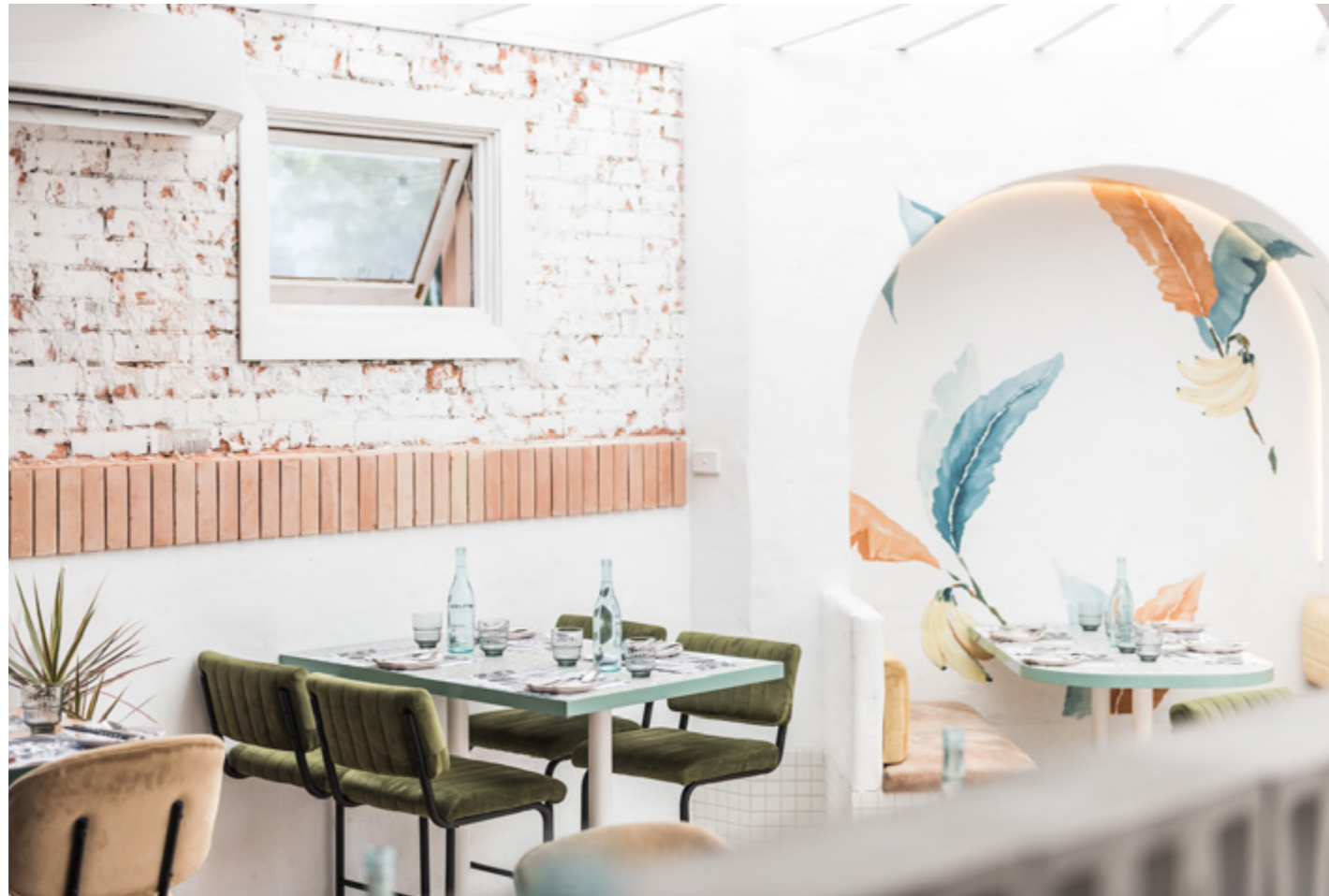
Light Years – 700m