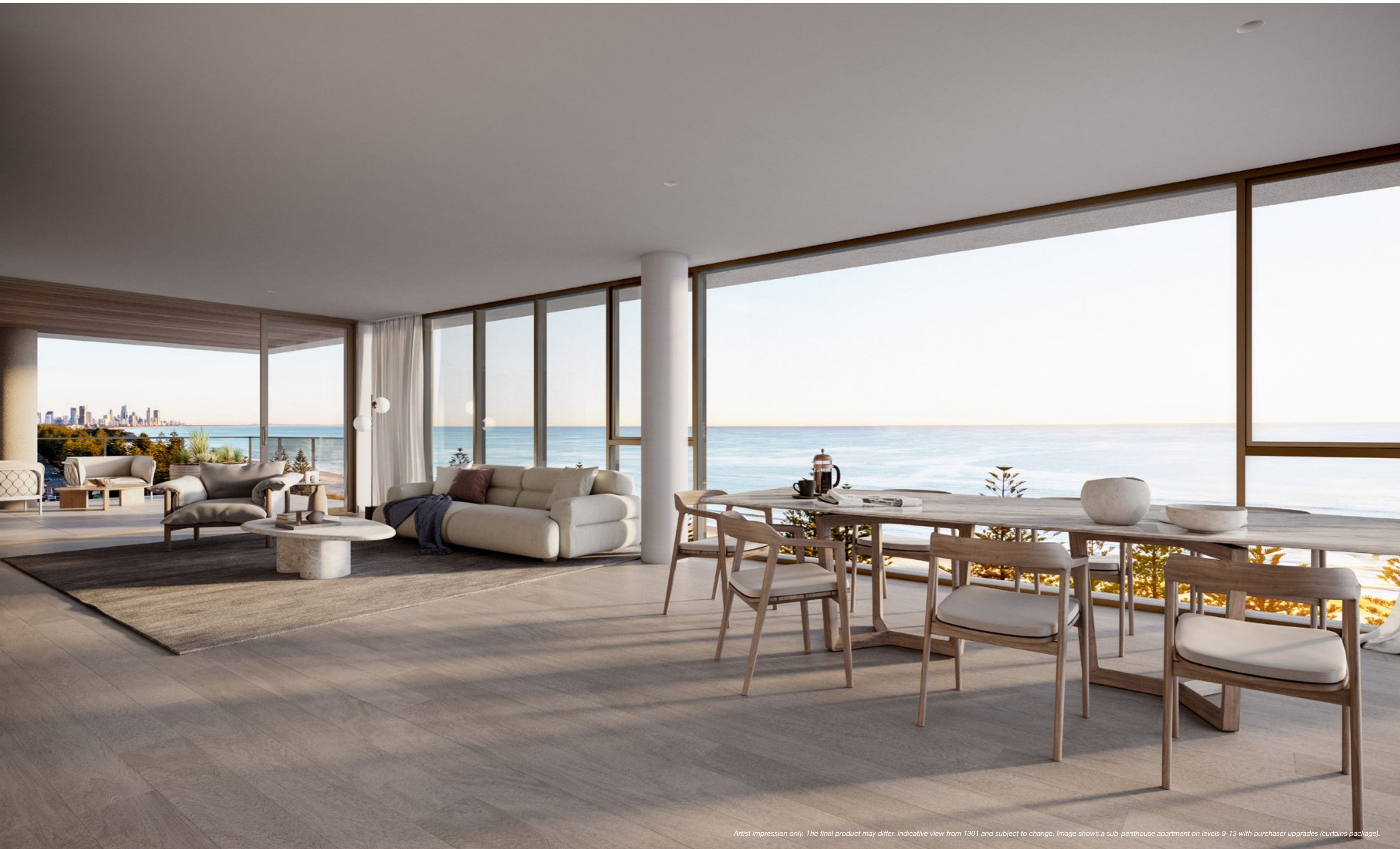
Artist impression only. The final product may differ. Indicative view from 1301 and subject to change. Image shows a sub-penthouse apartment on levels 9-13 with purchaser upgrades (curtains package).