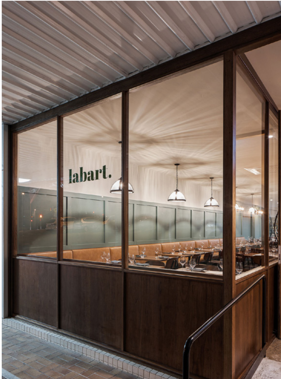
Restaurant Labart – 360m