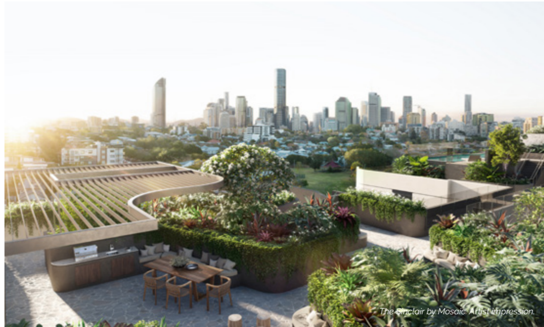
The Sinclair by Mosaic. Artist impression.