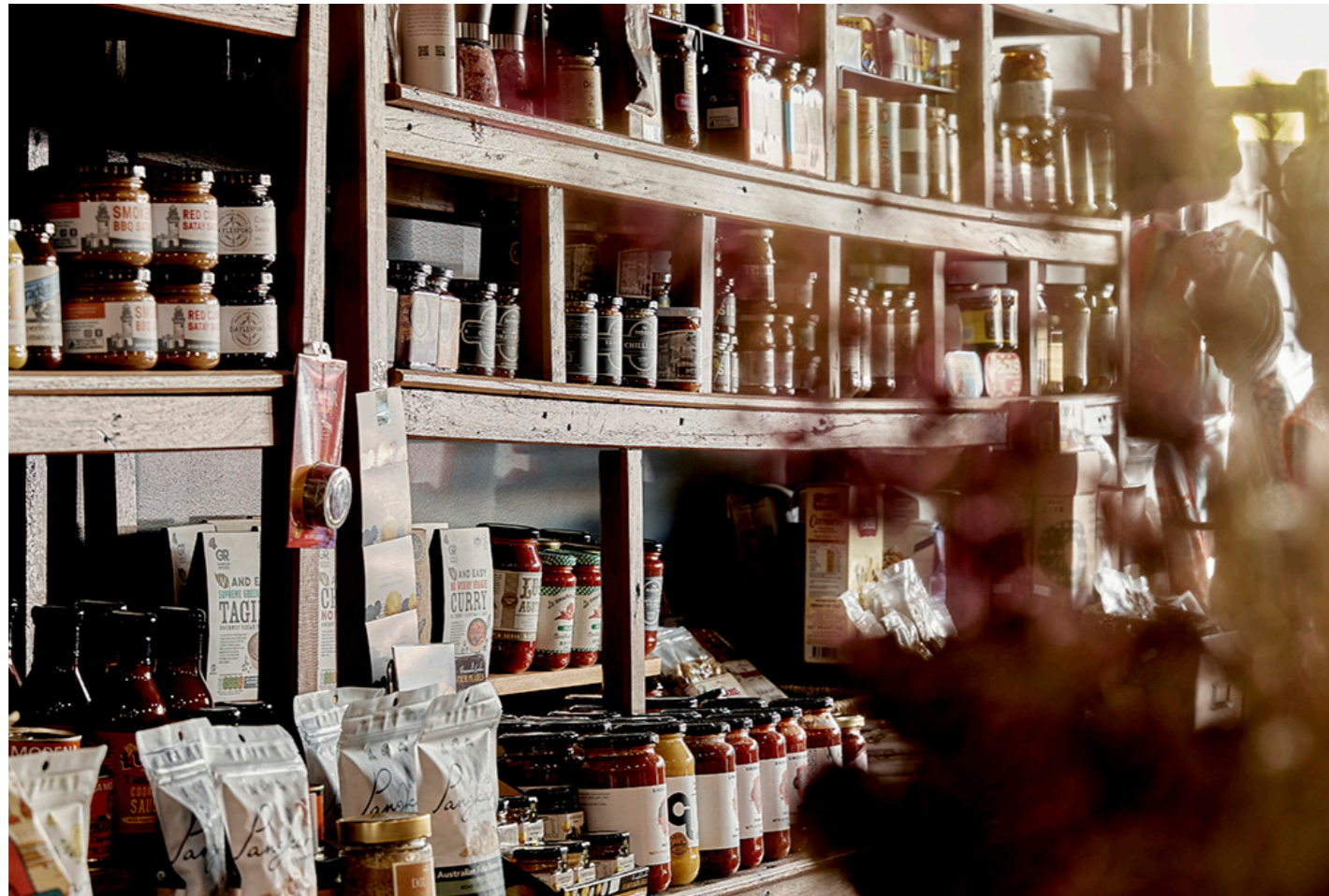
Golosi Fine Food Emporium – 300m