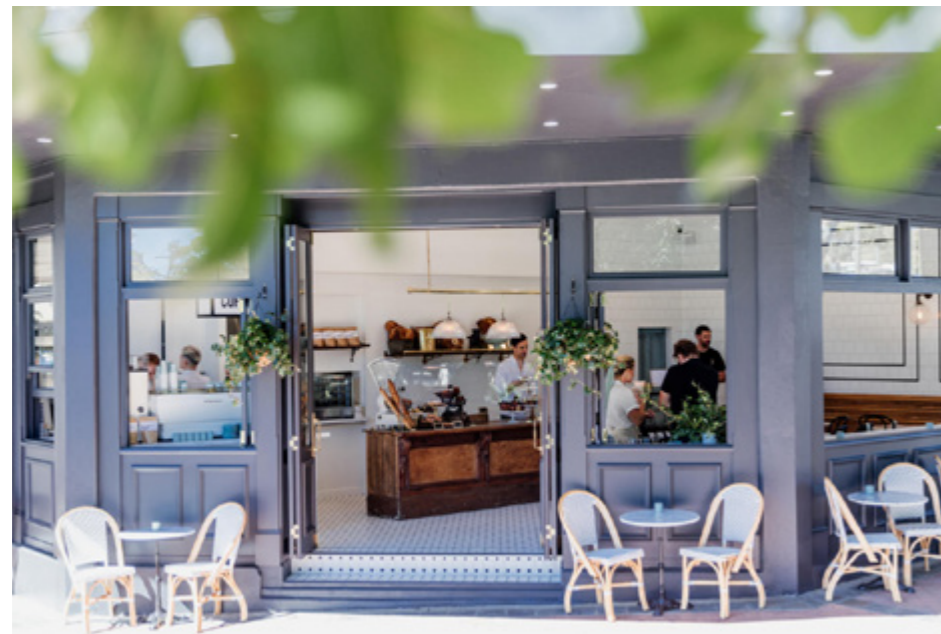
Tarte Bakery & Cafe – 210m