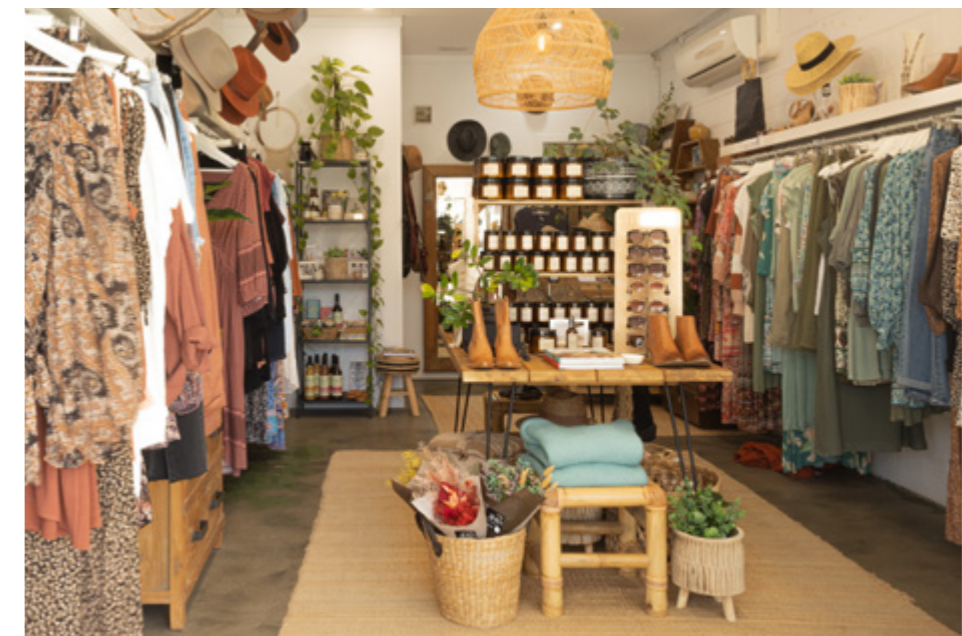
Bird on a Wire - 650m