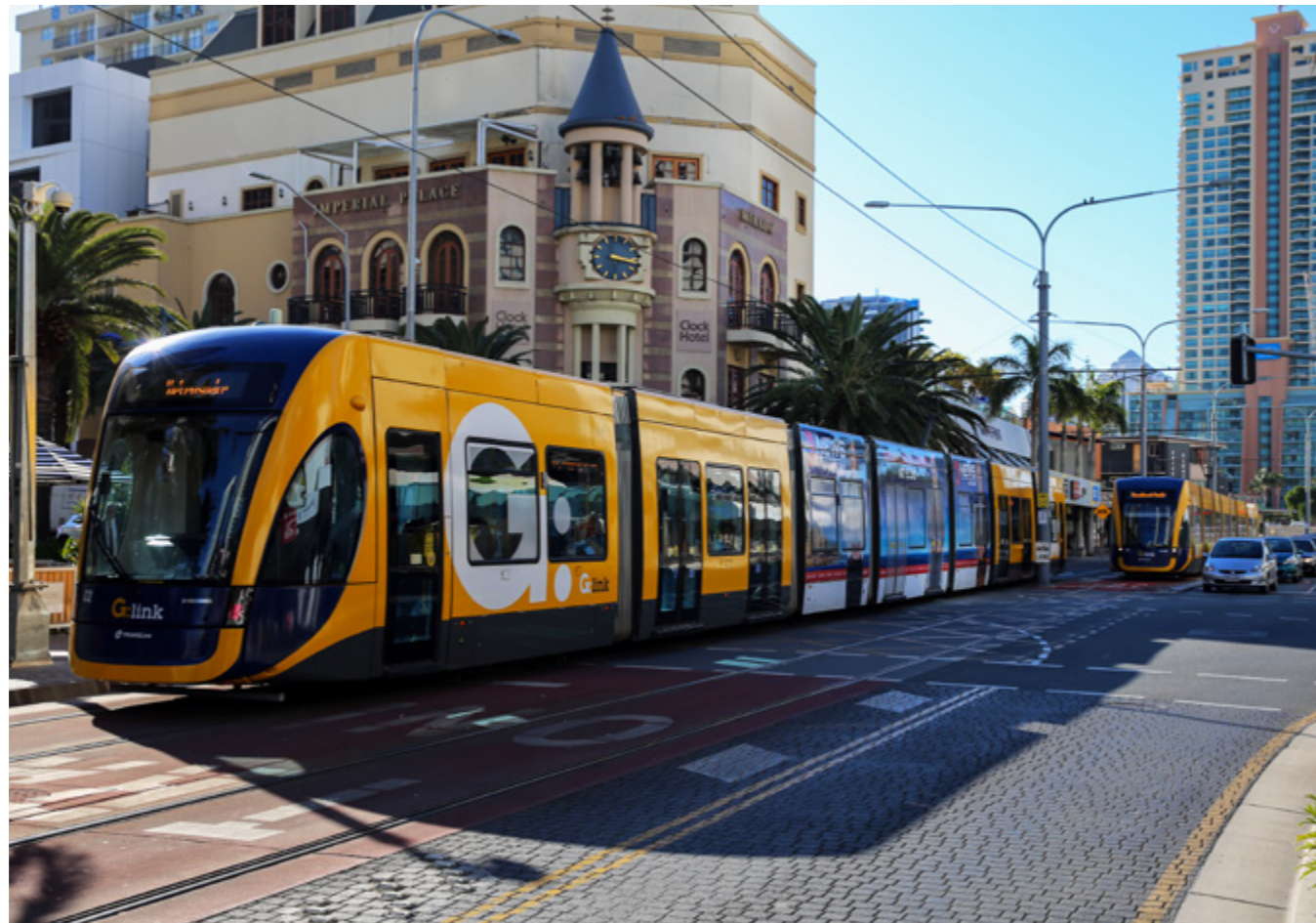
Second Avenue Light Rail Stop – 280m