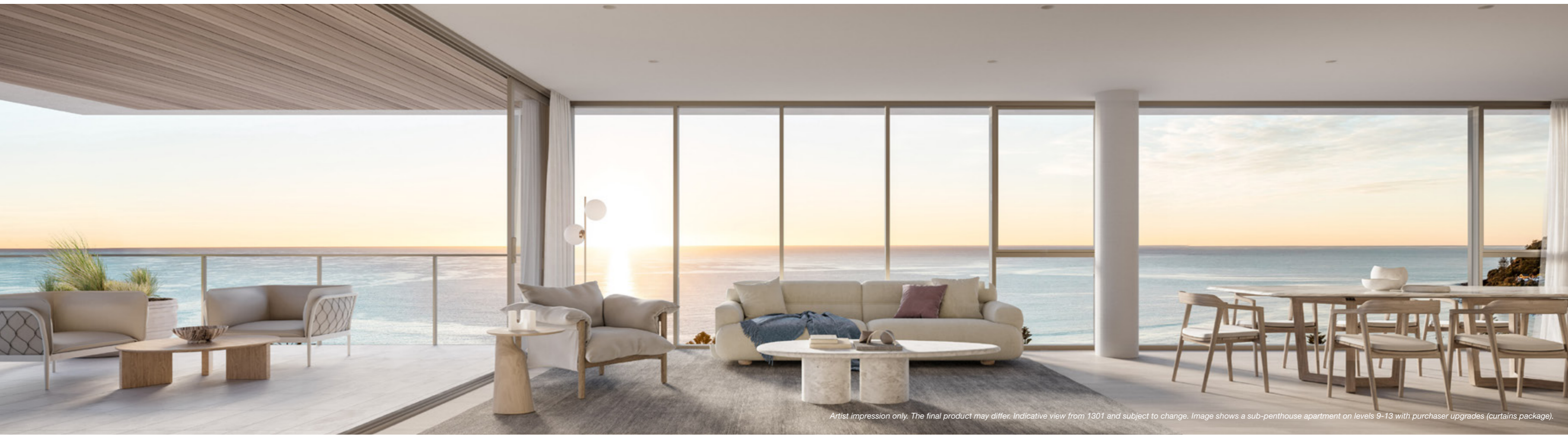
Artist impression only. The final product may differ. Indicative view from 1301 and subject to change. Image shows a sub-penthouse apartment on levels 9-13 with purchaser upgrades (curtains package).