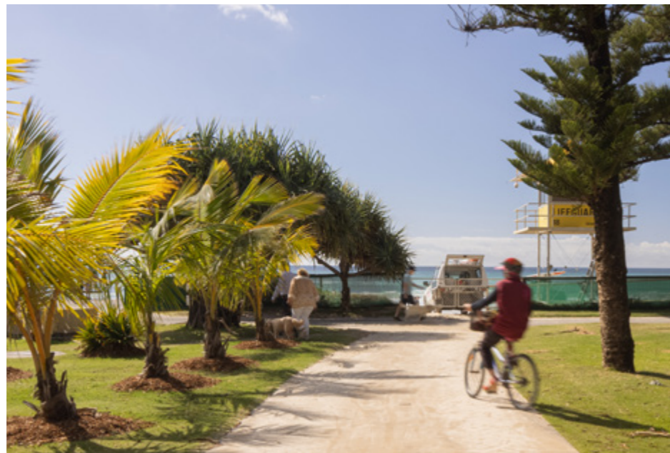
Mowbray Park – 500m