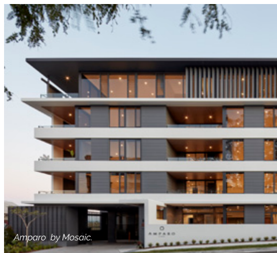
Amparo by Mosaic.