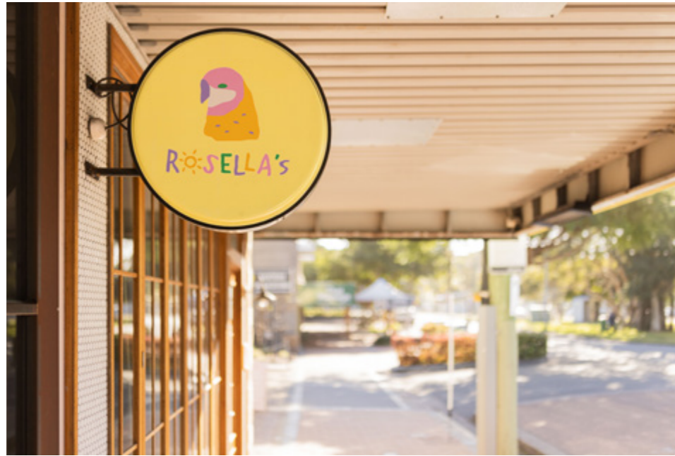
Rosella's – 200m