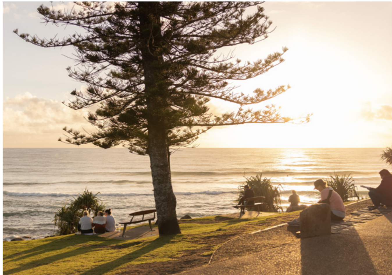
John Laws Park – 700m