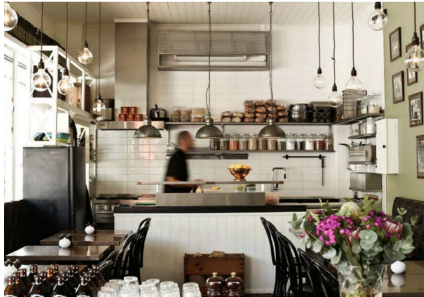
Canteen Kitchen – 400m