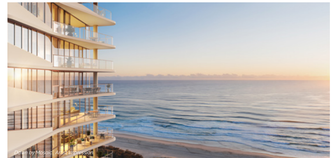
Dawn by Mosaic. Artist impression.