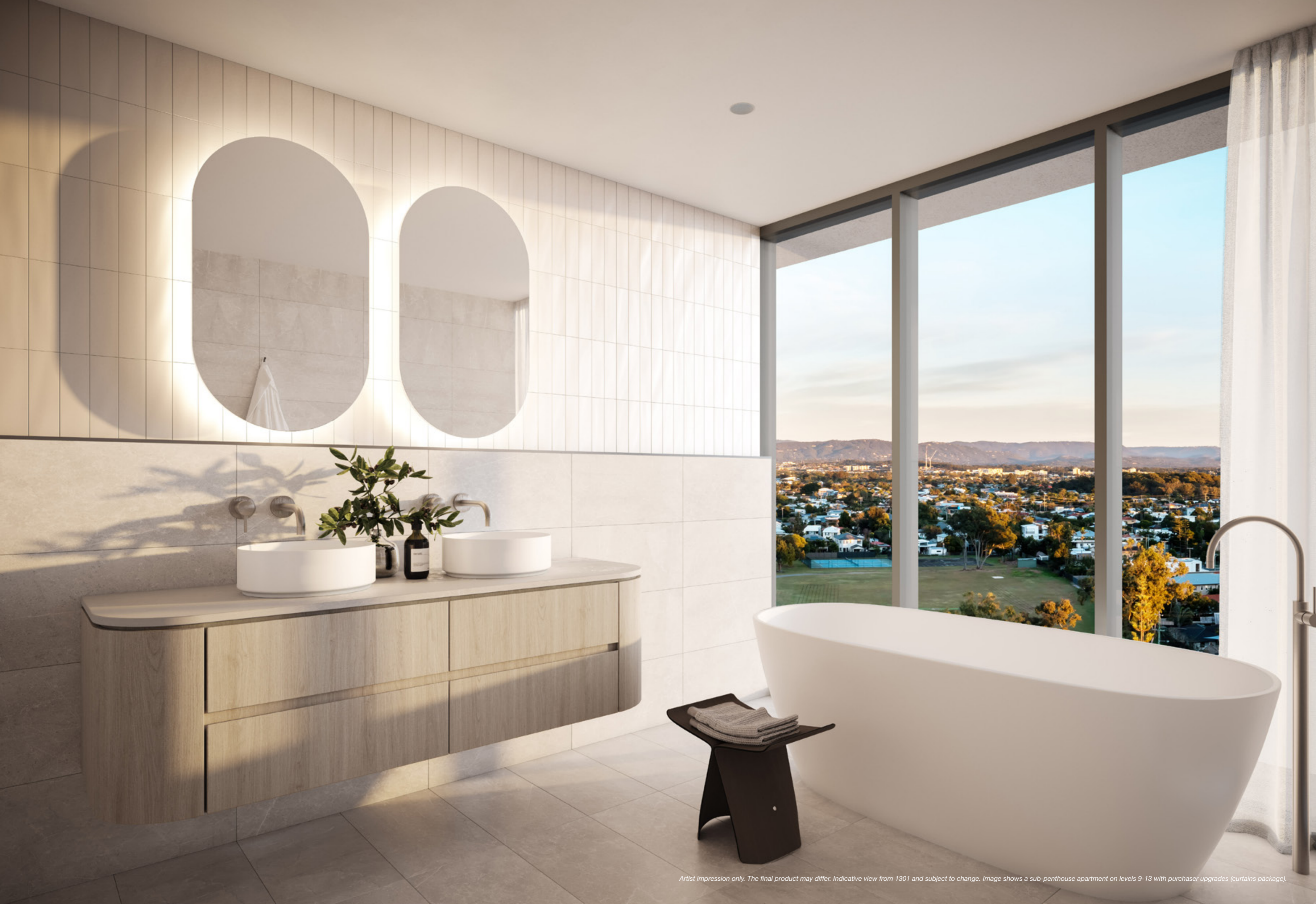
Artist impression only. The final product may differ. Indicative view from 1301 and subject to change. Image shows a sub-penthouse apartment on levels 9-13 with purchaser upgrades (curtains package).