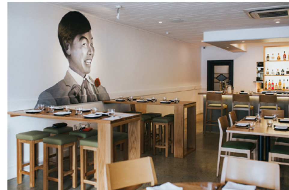
Jimmy Wah's - 260m