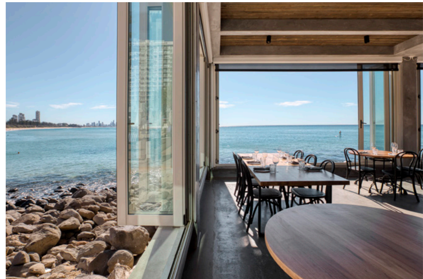
Rick Shores - 550m