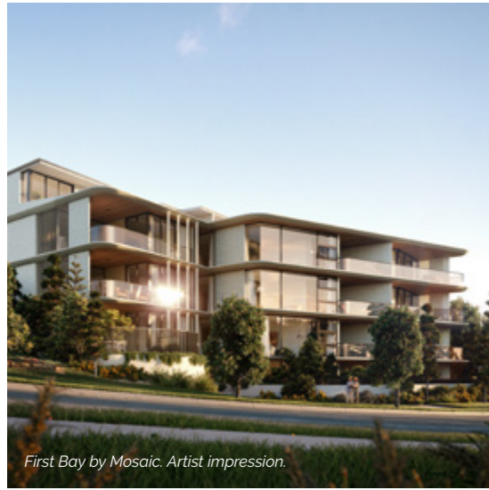
First Bay by Mosaic. Artist impression.