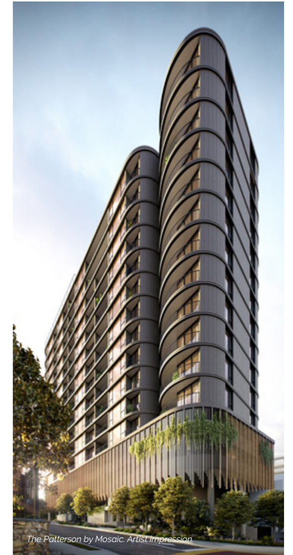
The Patterson by Mosaic. Artist impression.