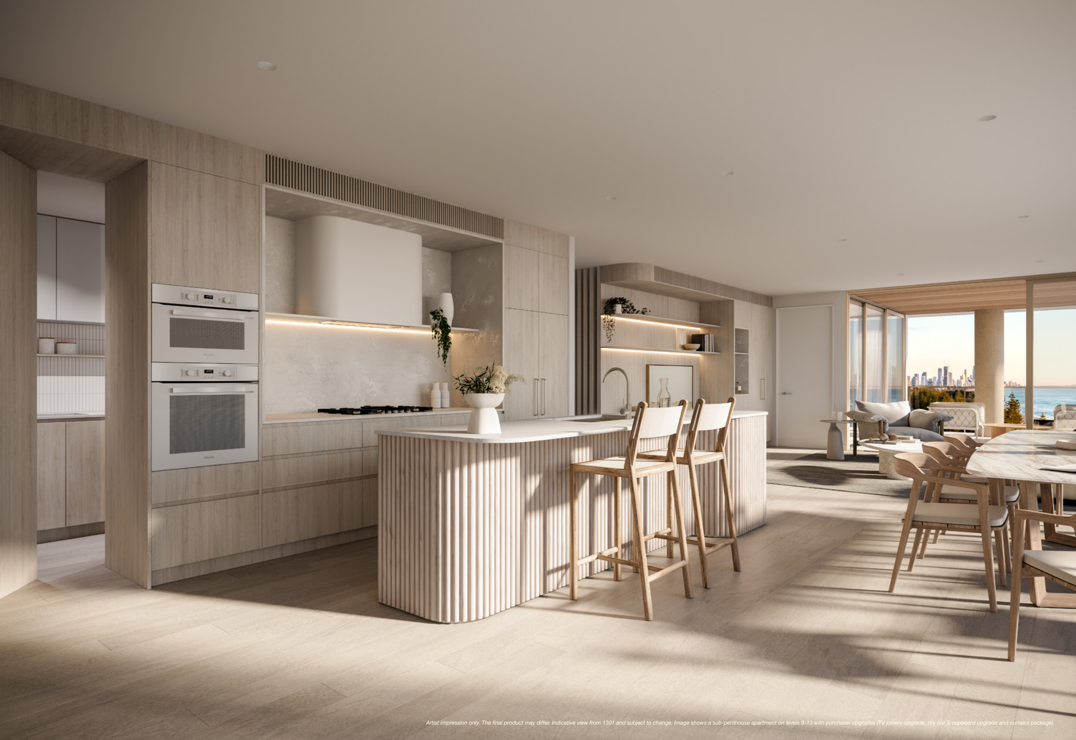
Artist impression only. The final product may differ. Indicative view from 1301 and subject to change. Image shows a sub-penthouse apartment on levels 9-13 with purchaser upgrades (TV joinery upgrade, dry bar & cupboard upgrade and curtains package).