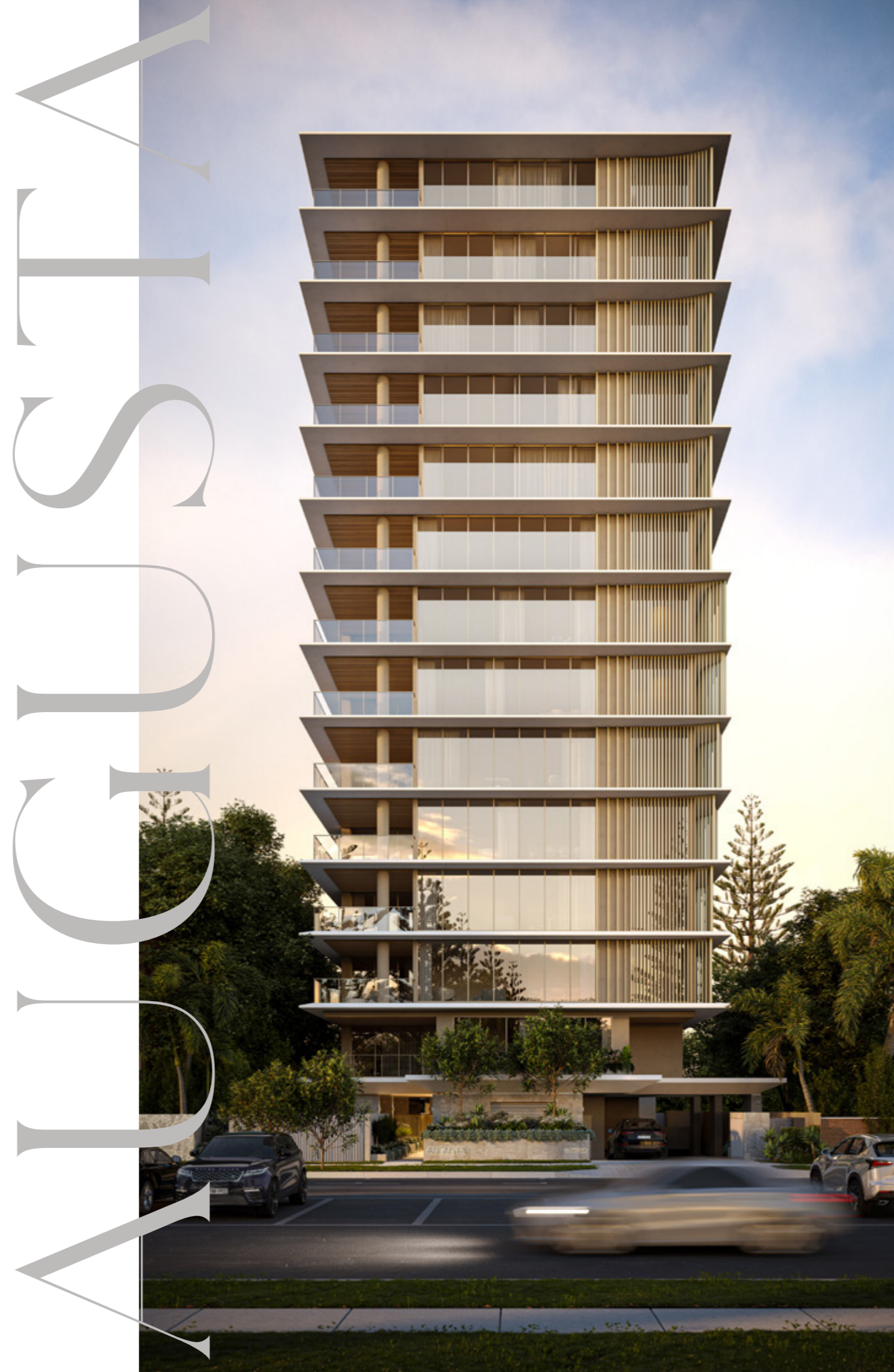
Artist impression only. The final product may differ. Landscaping indicative only. Refer to back page.