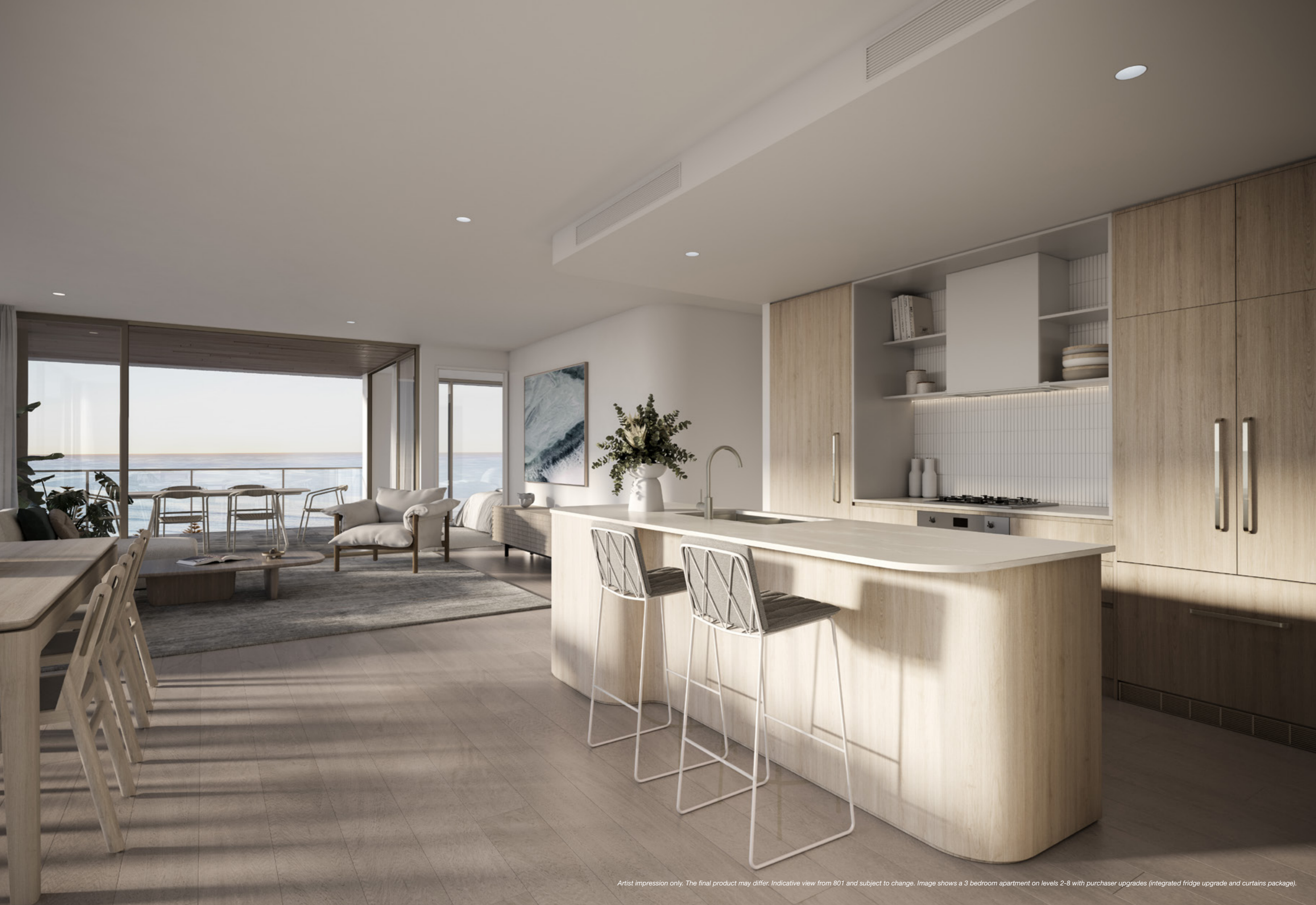
Artist impression only. The final product may differ. Indicative view from 801 and subject to change. Image shows a 3 bedroom apartment on levels 2-8 with purchaser upgrades (integrated fridge upgrade and curtains package).