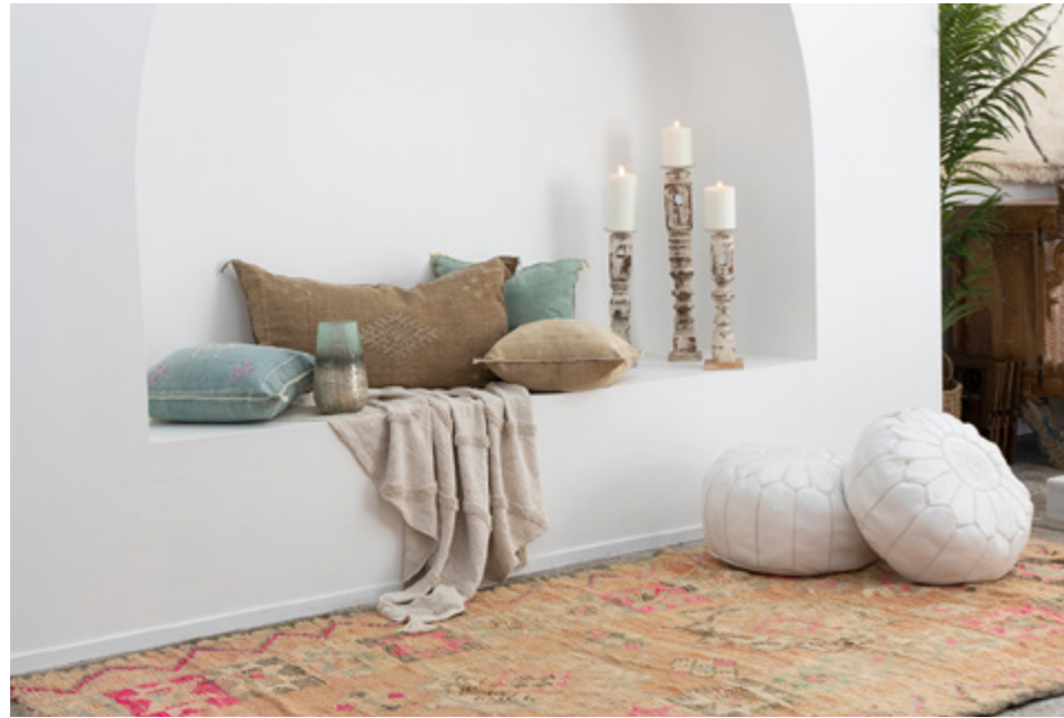
Maison & Maison – 300m