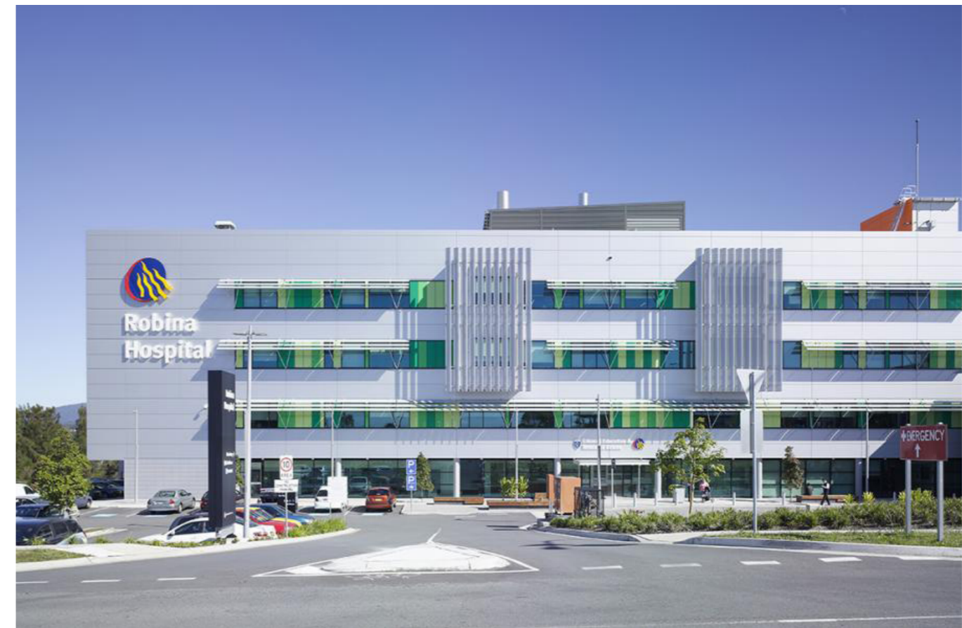
Robina Hospital - 7.5km